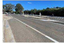
Clean roads, unobstructed entry