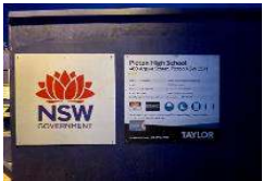
Site Notices and hoarding