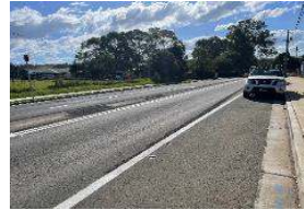
Clean roads, unobstructed entry