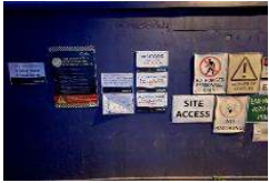
Site Notices and hoarding