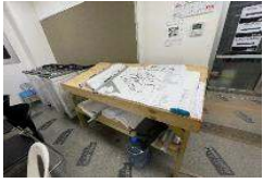
Approved and certified plans