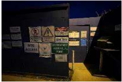
Site Notices and hoarding