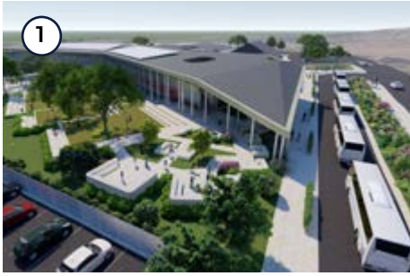
Bus bay and parking