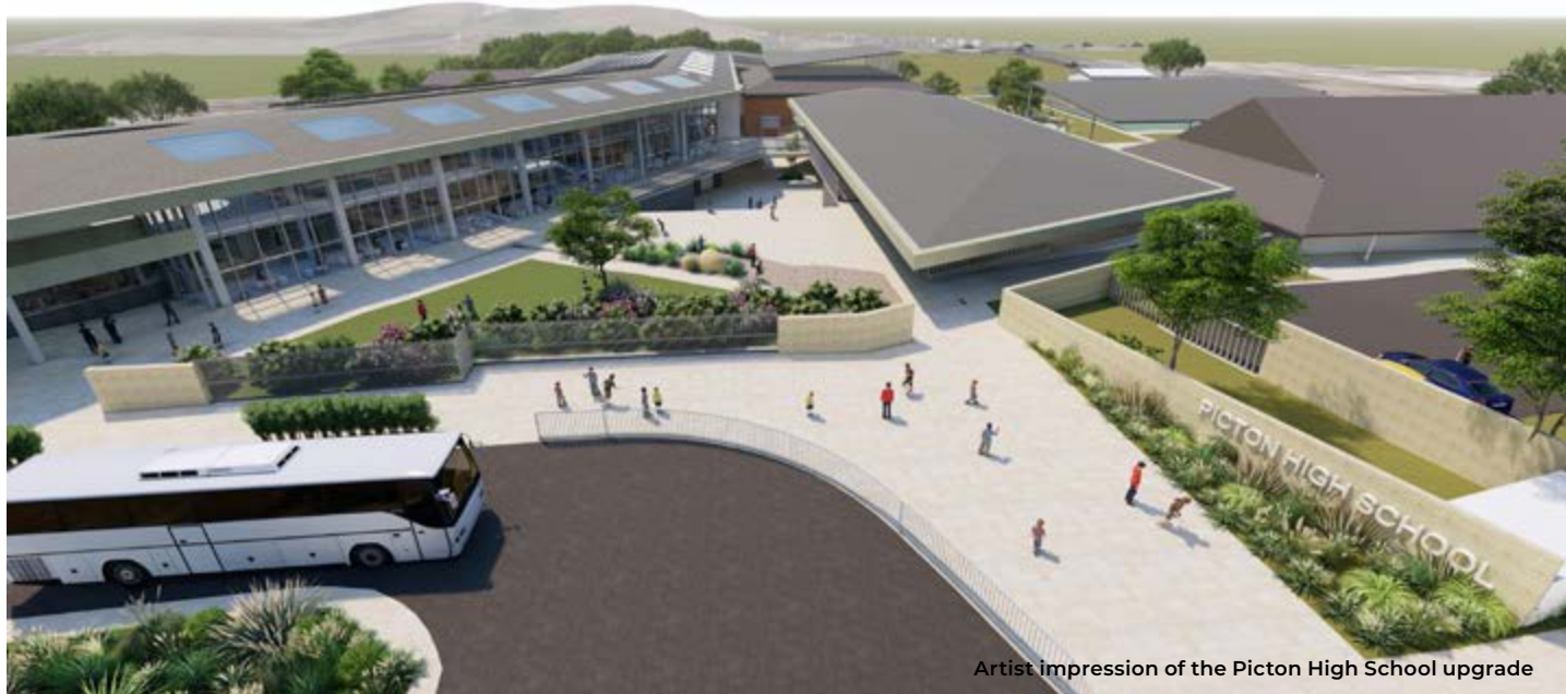
Artist impression of the Picton High School upgrade

The NSW Government is investing $6.7 billion over four years to deliver more than 190 new and upgraded schools to support communities across NSW. In addition, a record $1.3 billion is being spent on school maintenance over five years, along with a record $500 million for the sustainable Cooler Classrooms program to provide air conditioning to schools. This is the largest investment in public education infrastructure in the history of NSW.