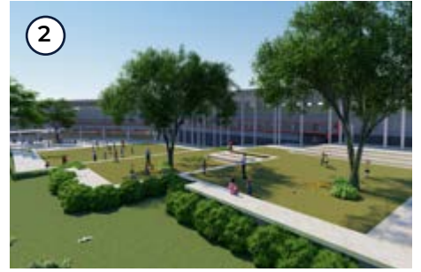
Northern courtyard tiered