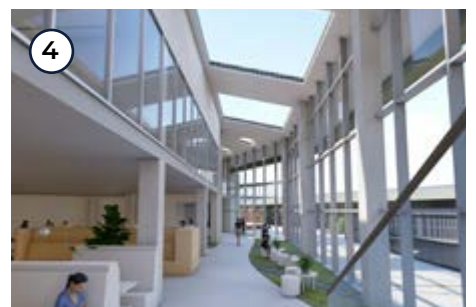
Student hub and circulation spine