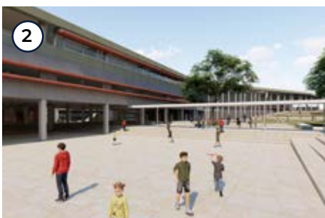
Northern courtyard activity area