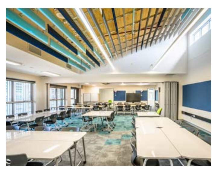
New flexible learning space