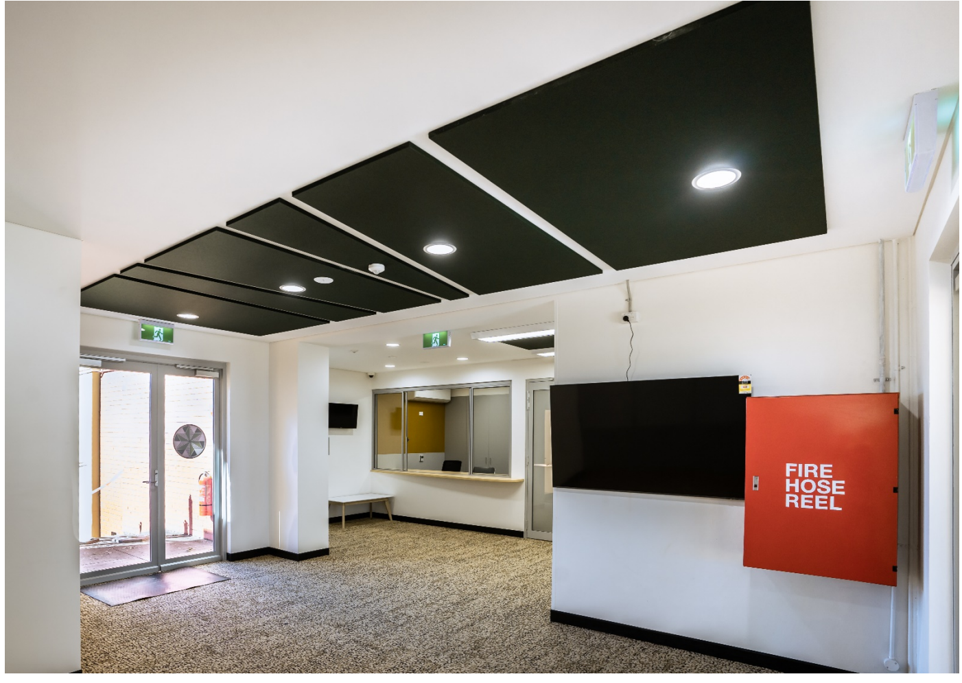
The administration building's main reception area.

NSW Department of Education – School Infrastructure