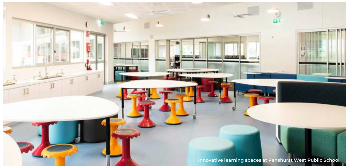
Innovative learning spaces at Penshurst West Public School