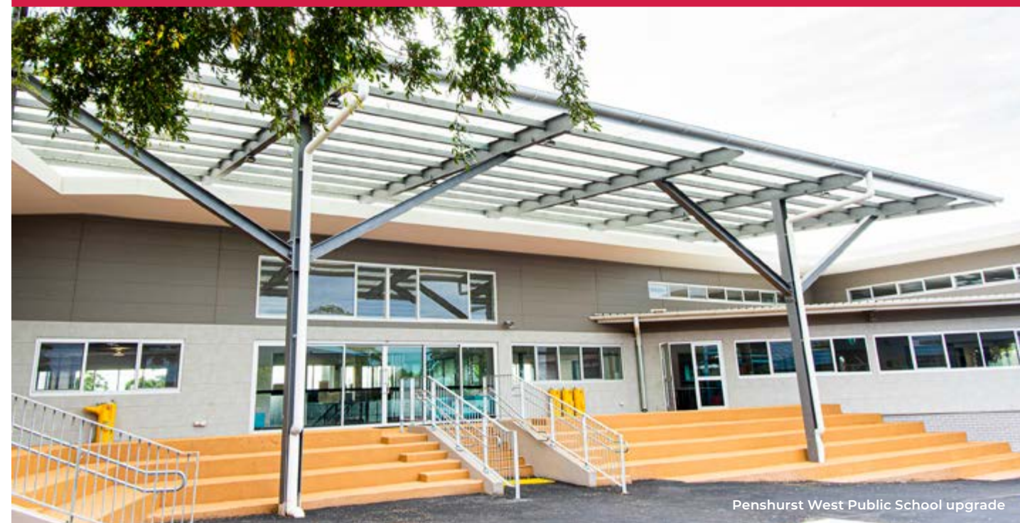
Penshurst West Public School upgrade