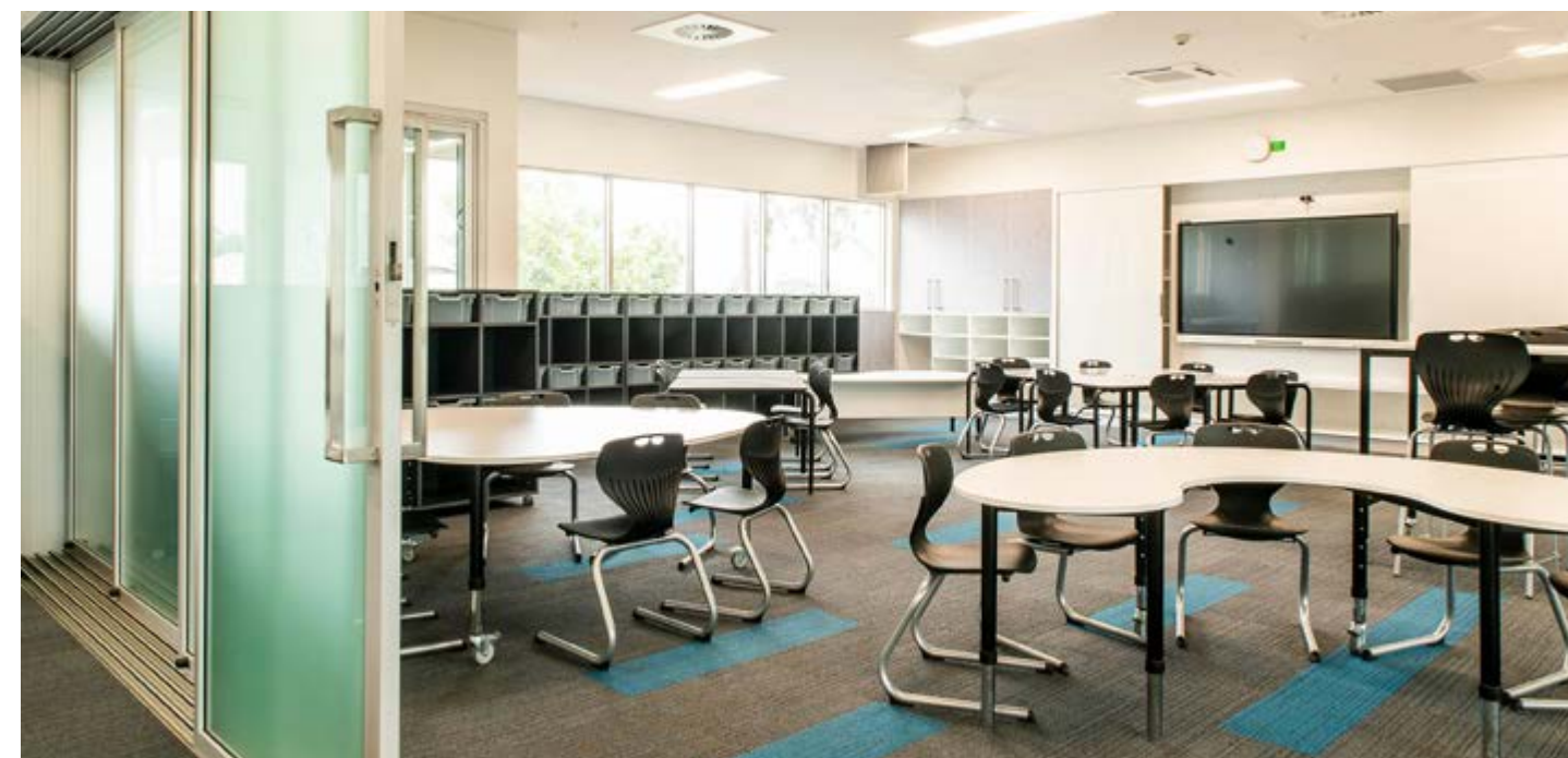
Innovative learning spaces