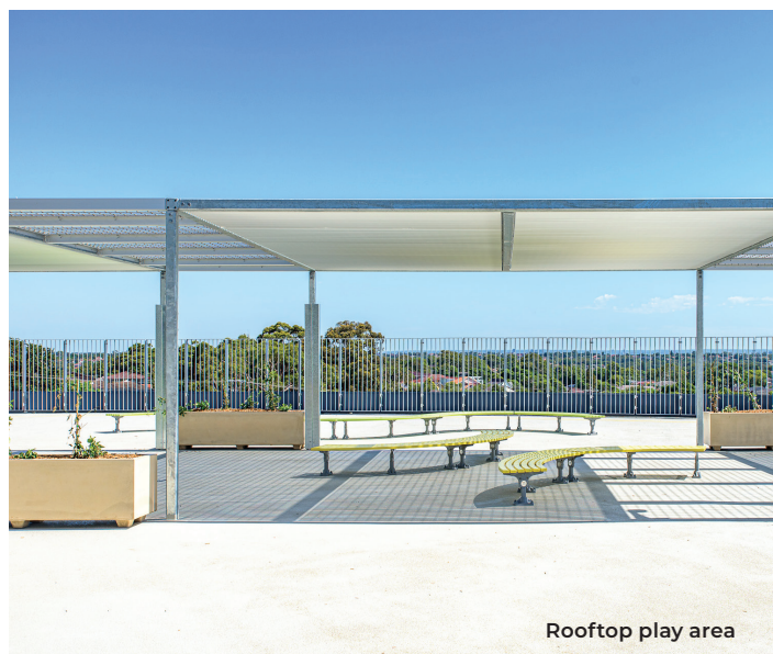
Rooftop play area