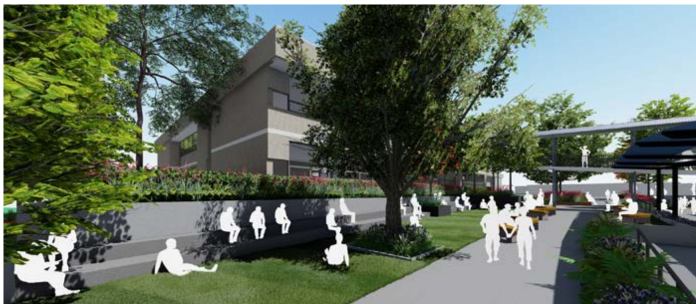
Artist Impression of the Pendle Hill High School