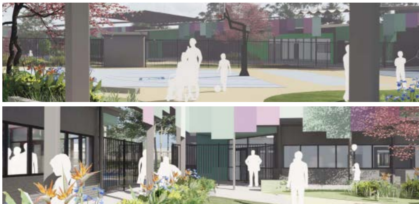
Concept design of the Passfield Park School redevelopment (artist impressions)