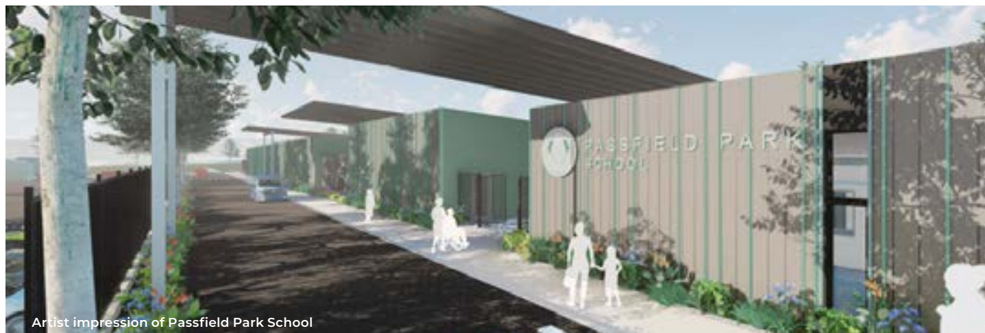
Artist impression of Passfield Park School