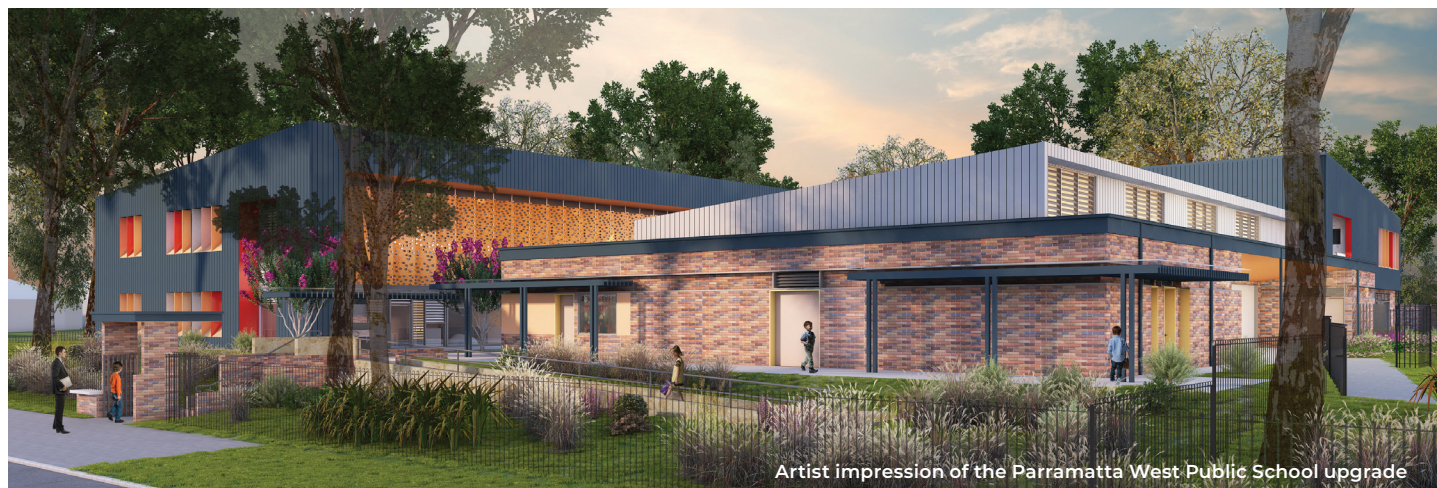
Artist impression of the Parramatta West Public School upgrade