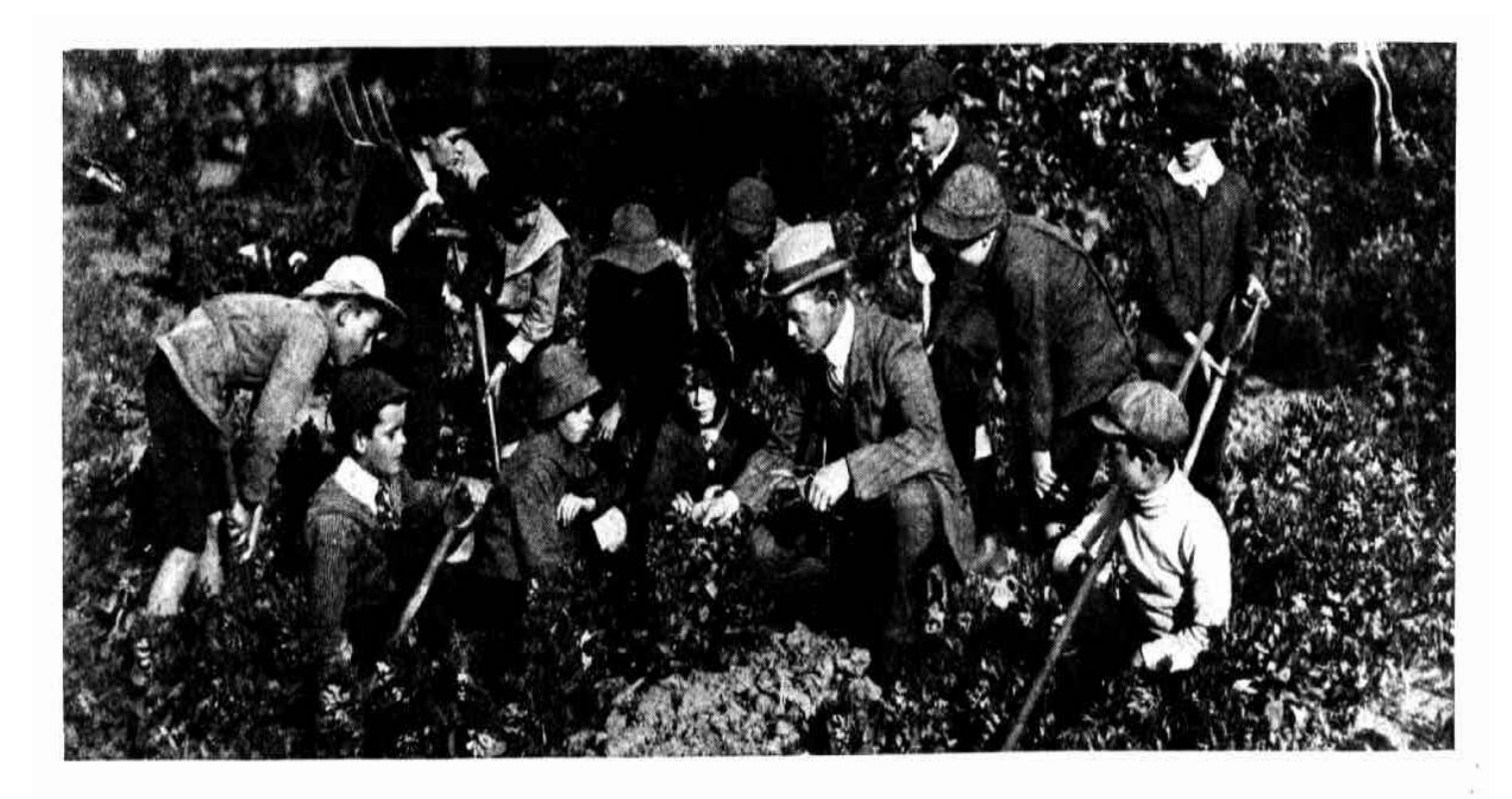
West Leichhardt Superior Public School Instruction -- "How to Bud Broad Beans."

Photo Reference (TROVE) Australian Town & Country Journal 30 Oct 1912 Public school children and their gardens How to bud broadbeans.