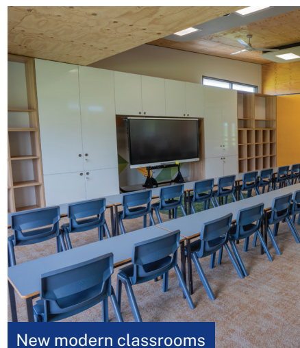
New modern classrooms