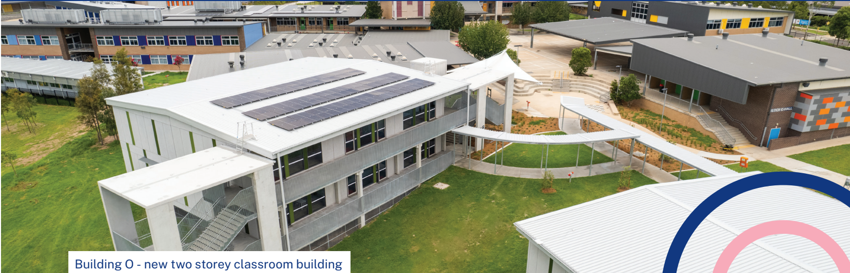
Building O - new two storey classroom building