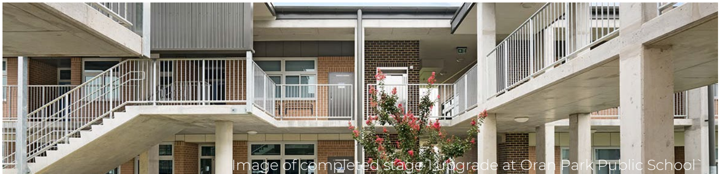
Image of completed stage 1 upgrade at Oran Park Public School