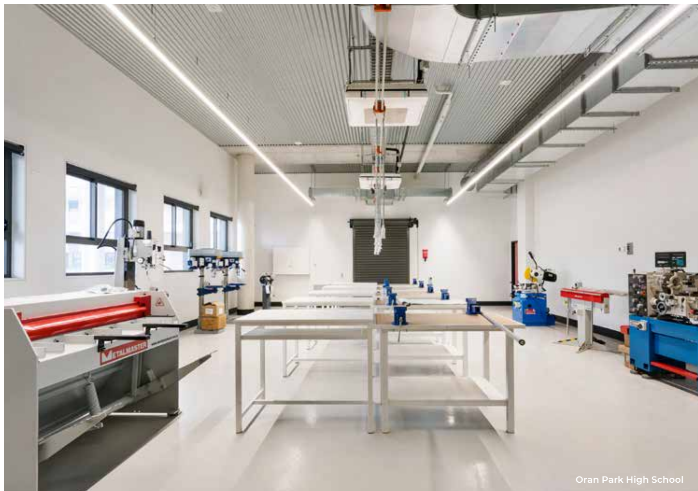
Oran Park High School