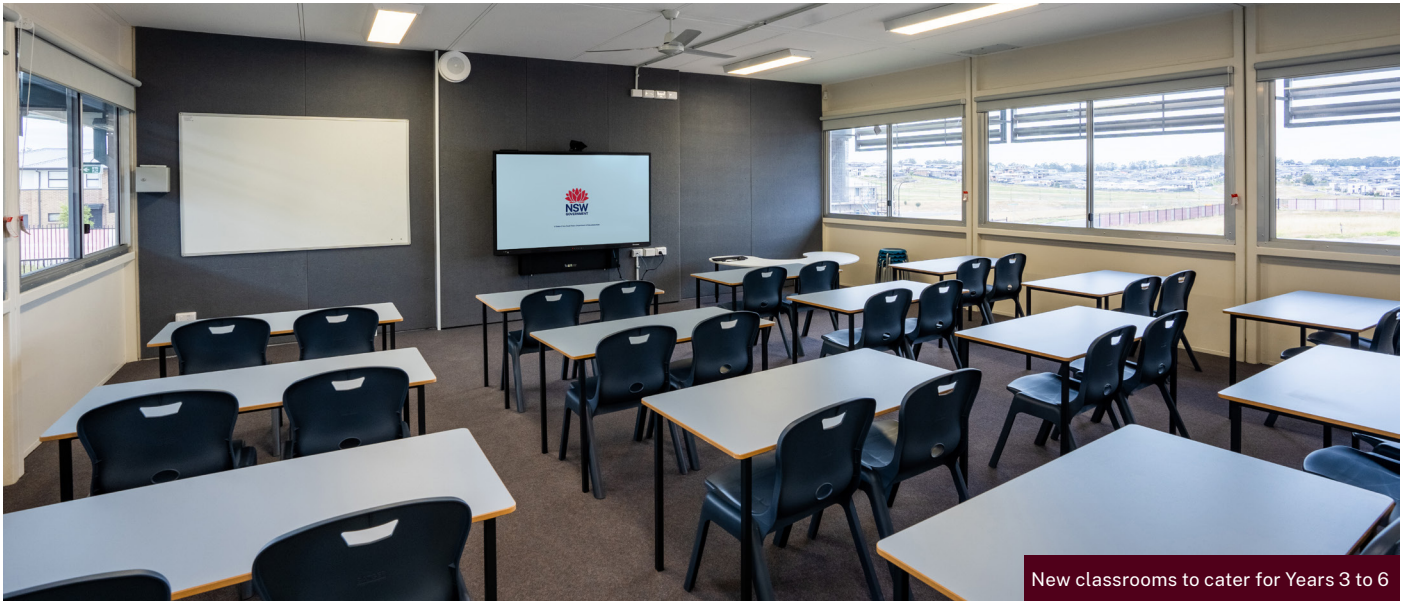
New classrooms to cater for Years 3 to 6