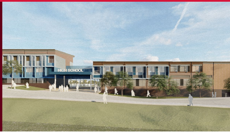
Image caption: Artist impression of Box Hill High School (subject to change)