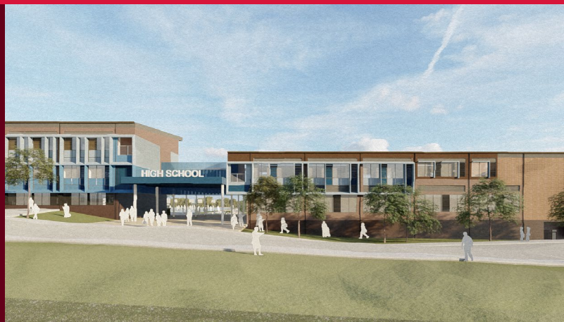
Image caption: Artist impression of Box Hill High School (subject to change)