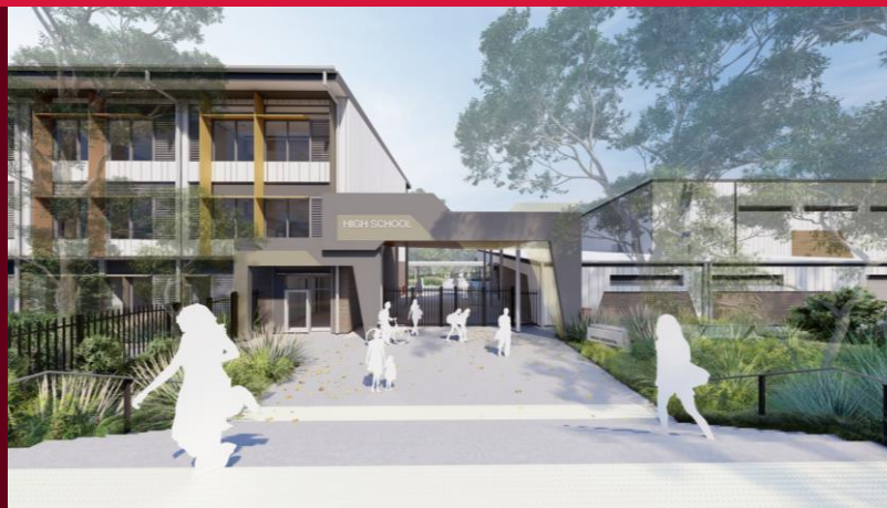
Image caption: Artist impression of the new school entry