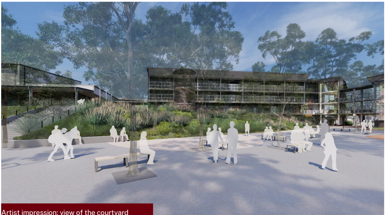
Artist impression: view of the courtyard

Artist impressions were shared with the community at the information session on 27 March 2025. To view the information boards presented, visit: edu.nsw.link/NewGoogongHS-infoboard