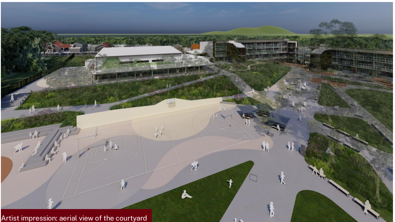
Artist impression: aerial view of the courtyard

We will notify the community if we need to perform unexpected out-of-hours works.