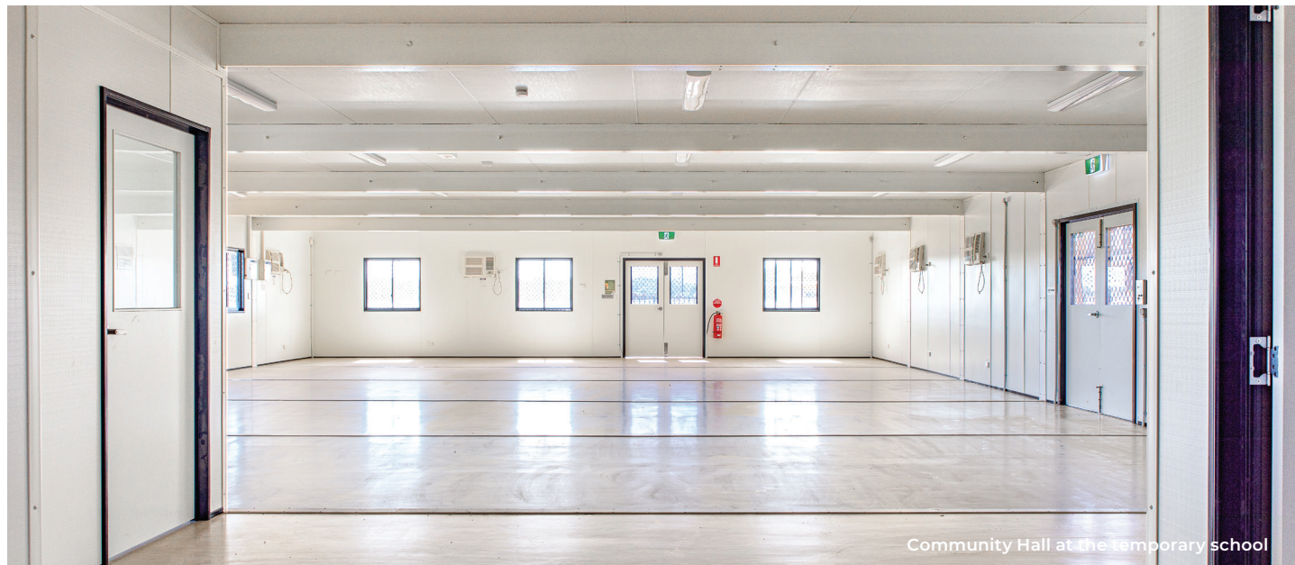
Community Hall at the temporary school