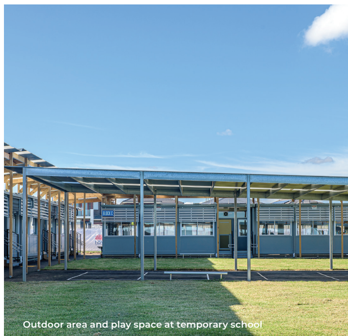
Outdoor area and play space at temporary school

While there is no canteen at the temporary school, we encourage parents and carers to make sure students bring their own refreshments. A canteen will be available in the permanent school from mid 2021.