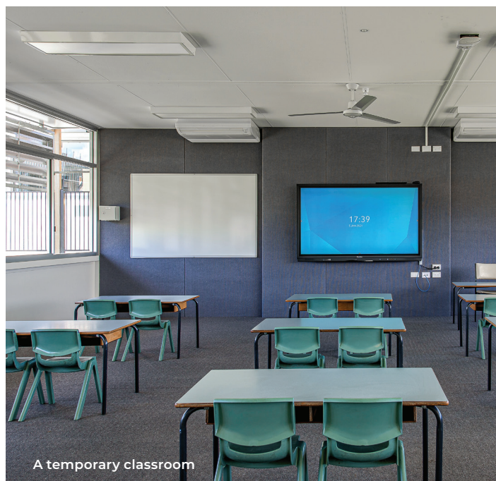
A temporary classroom