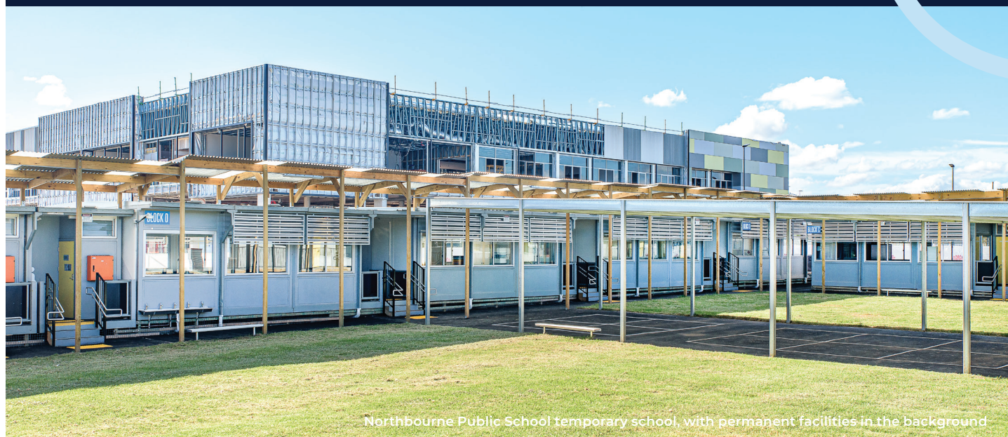
Northbourne Public School temporary school, with permanent facilities in the background