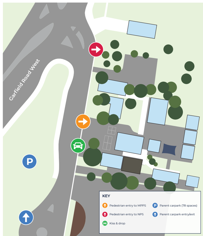
Map of Marsden Park Public School

We are committed to working together with our school communities and other stakeholders to deliver the best possible learning facilities for students. Your feedback on this project is important to us. For more information, questions or to make a comment please email us at schoolinfrastructure@det.nsw.edu.au .