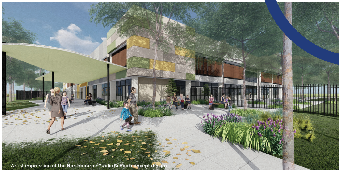
Artist impression of the Northbourne Public School concept design