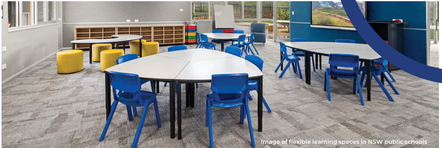
Image of flexible learning spaces in NSW public schools