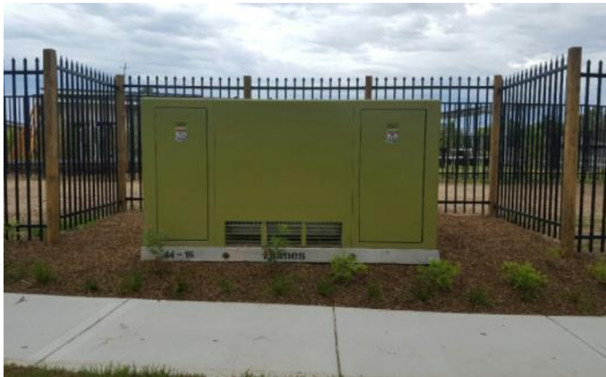
Example of school fencing around substation.

Following the completion of the works, school fencing will be re-installed behind the new substation to allow authorised technicians to have direct access from the public footpath.