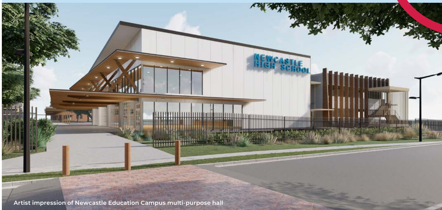
Artist impression of Newcastle Education Campus multi-purpose hall

The NSW Government is investing $8.6 billion in school infrastructure over the next four years, continuing its program to deliver 160 new and upgraded schools to support communities across NSW. This builds on the more than $9.1 billion invested in projects delivered since 2017, a program of $17.7 billion in public education infrastructure.