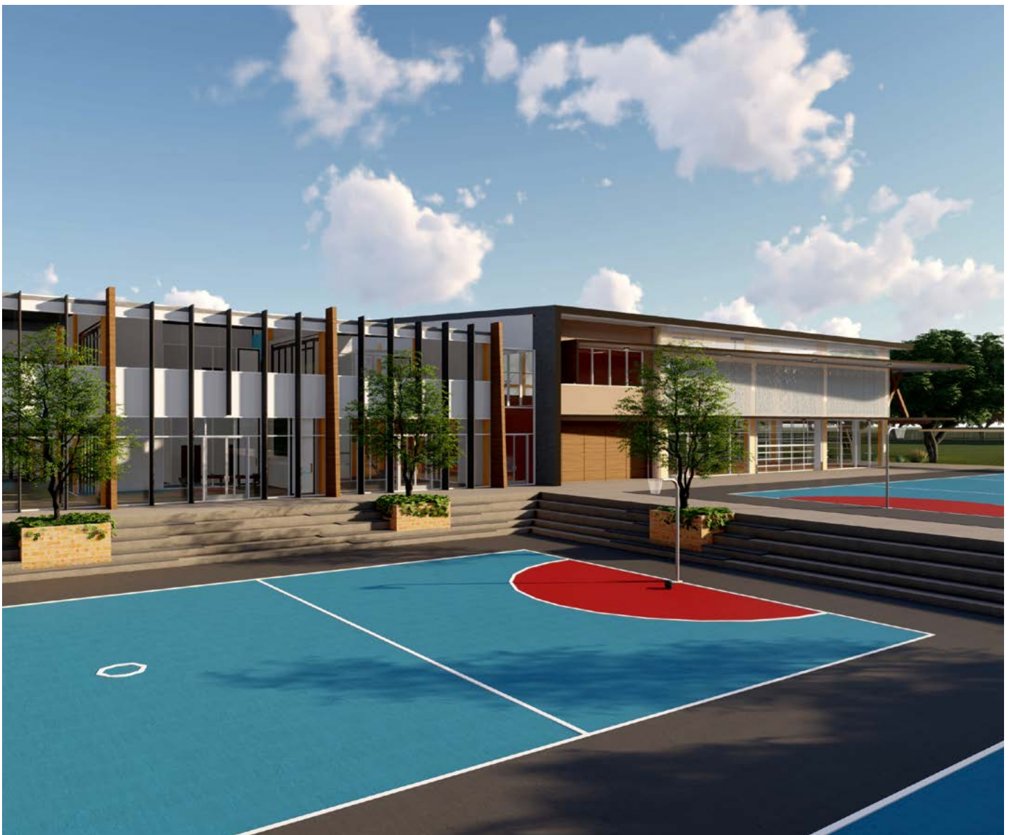
Artist impression of new sports courts with multi-purpose facility in the background