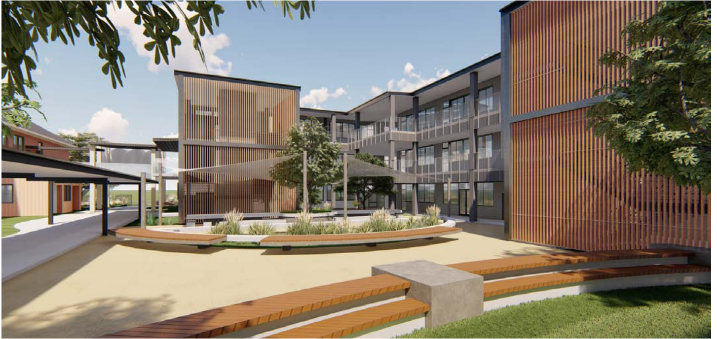
Internal courtyard in the new learning hub