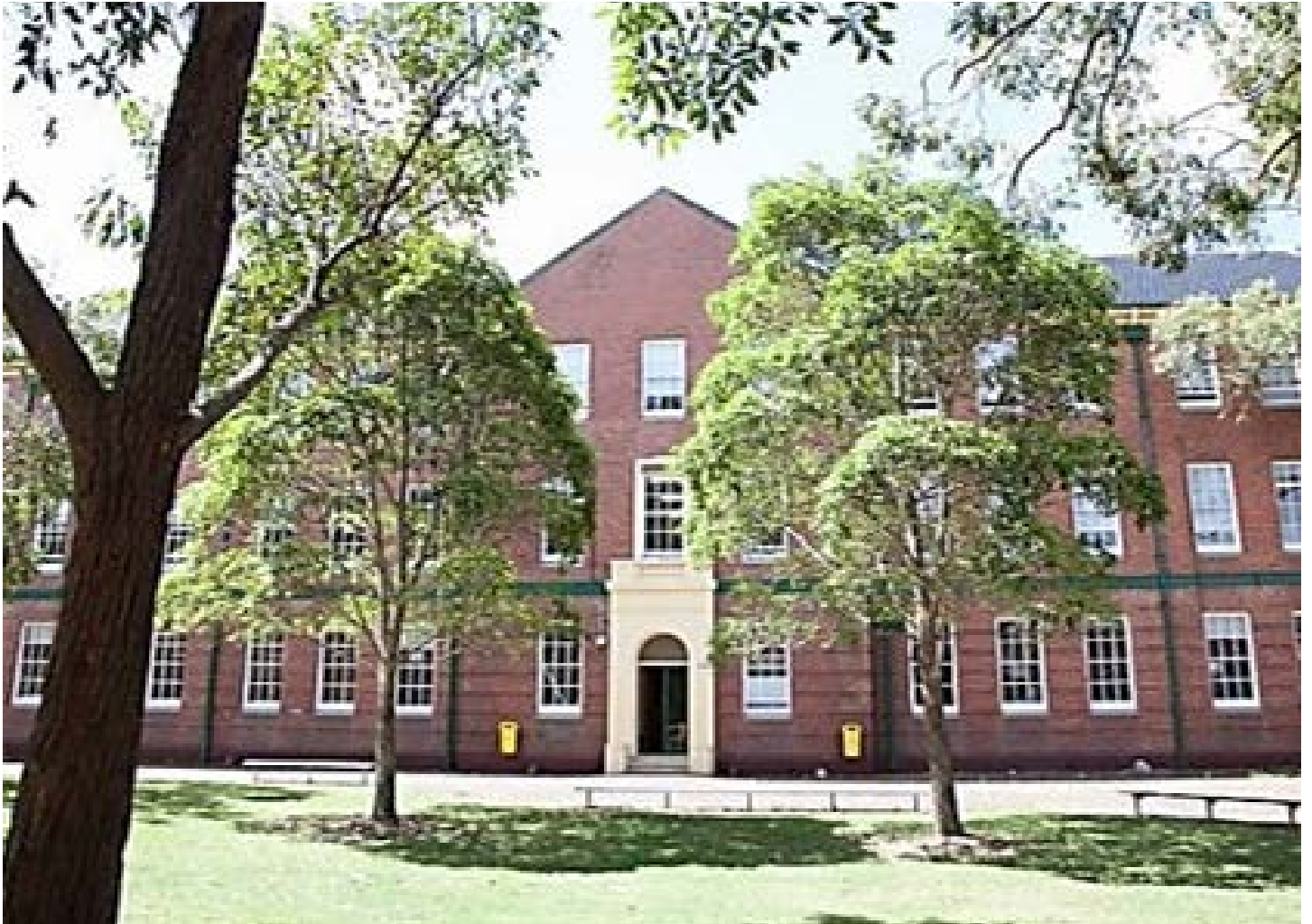
Former Newcastle Central Domestic Science School (circa 1930/31) being retained as part of this project

Several of the existing school buildings being retained as part of this project have heritage significance. These include Buildings A and L, which were originally part of Newcastle Girls High School (circa 1928/29), and Building C, which was the former Newcastle Central Domestic Science School (circa 1930/31).