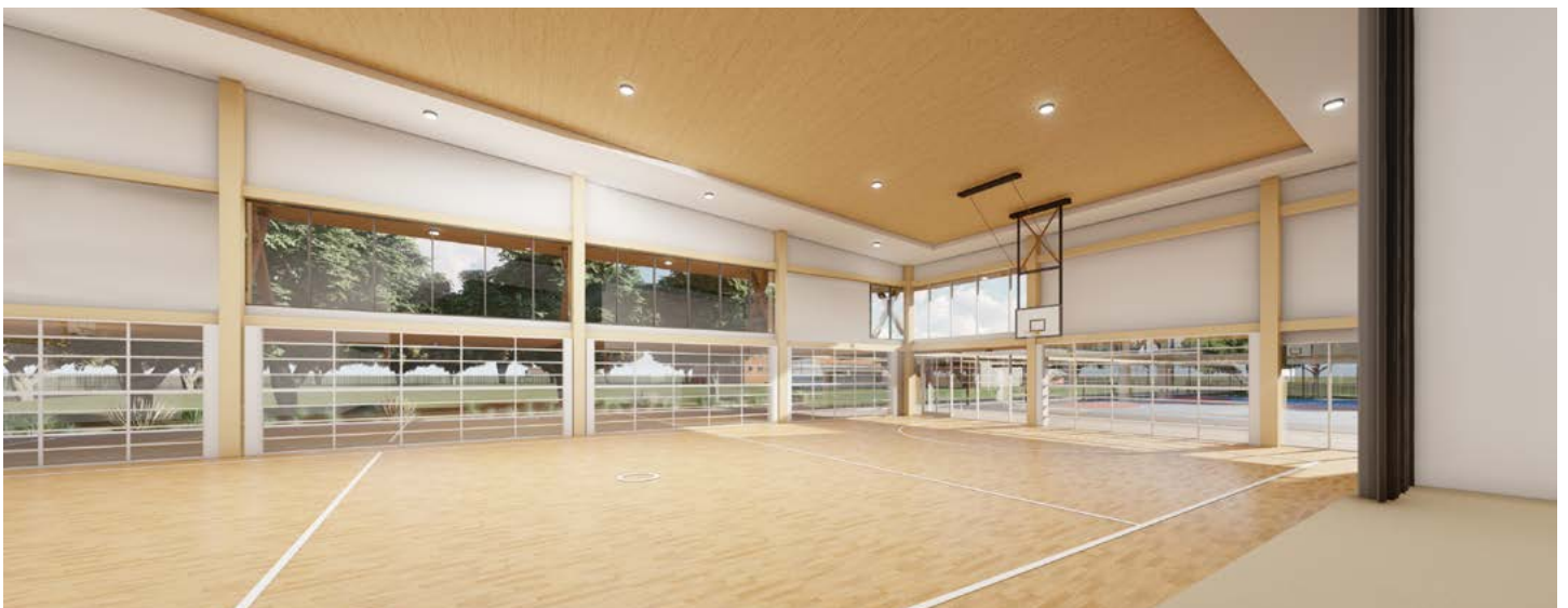
Internal view of the new multi-purpose facility

Once lodged, the SSD application will be on exhibition to the public for 28 days. We will notify the community when this happens