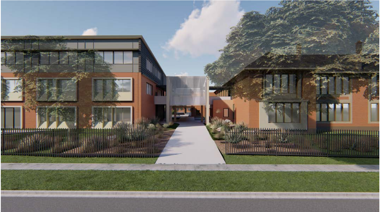
New school entry and learning hub from Parkway Avenue

We will continue to consult with the City of Newcastle, Transport for NSW and other key stakeholders as we carry out the technical studies, detailed site investigations and design development.