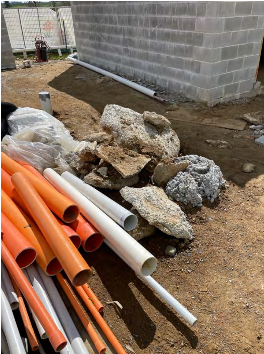
Photo 14 Concrete waste stockpile