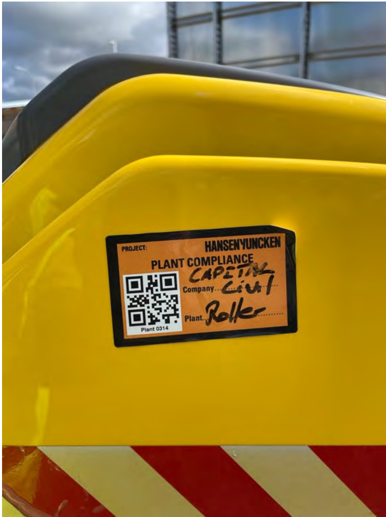
Photo 5 Hansen Yuncken plant and equipment certification sticker and servicing details