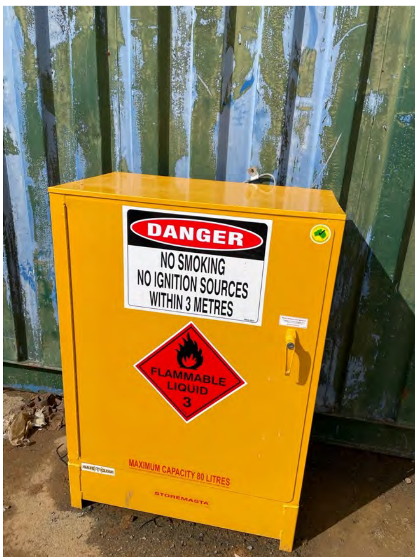
Photo 12 Dangerous goods cabinet onsite