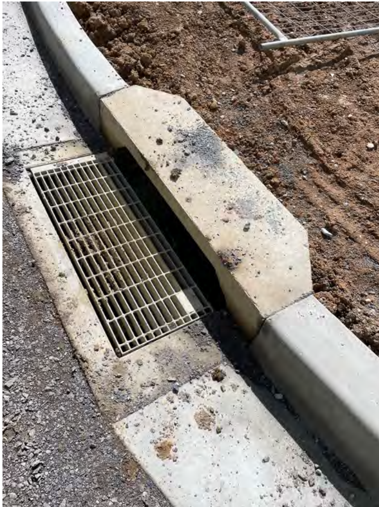
Photo 8 Unprotected stormwater drain at entry/exit to site