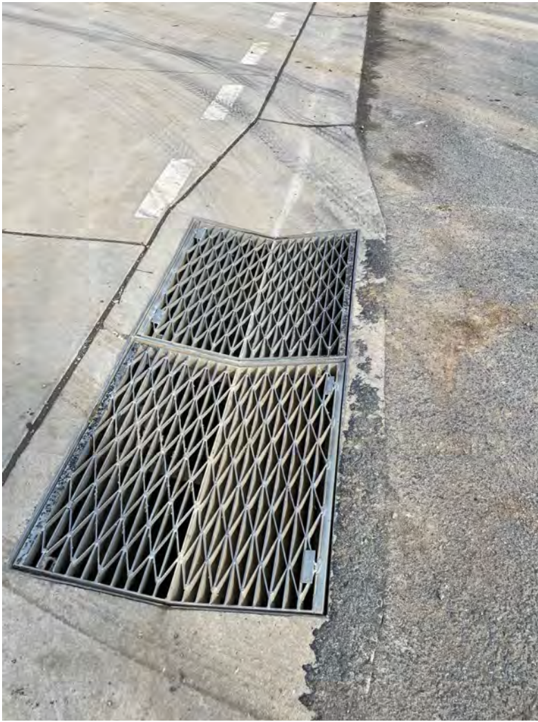
Photo 9 Unprotected stormwater drain at entry/exit to site