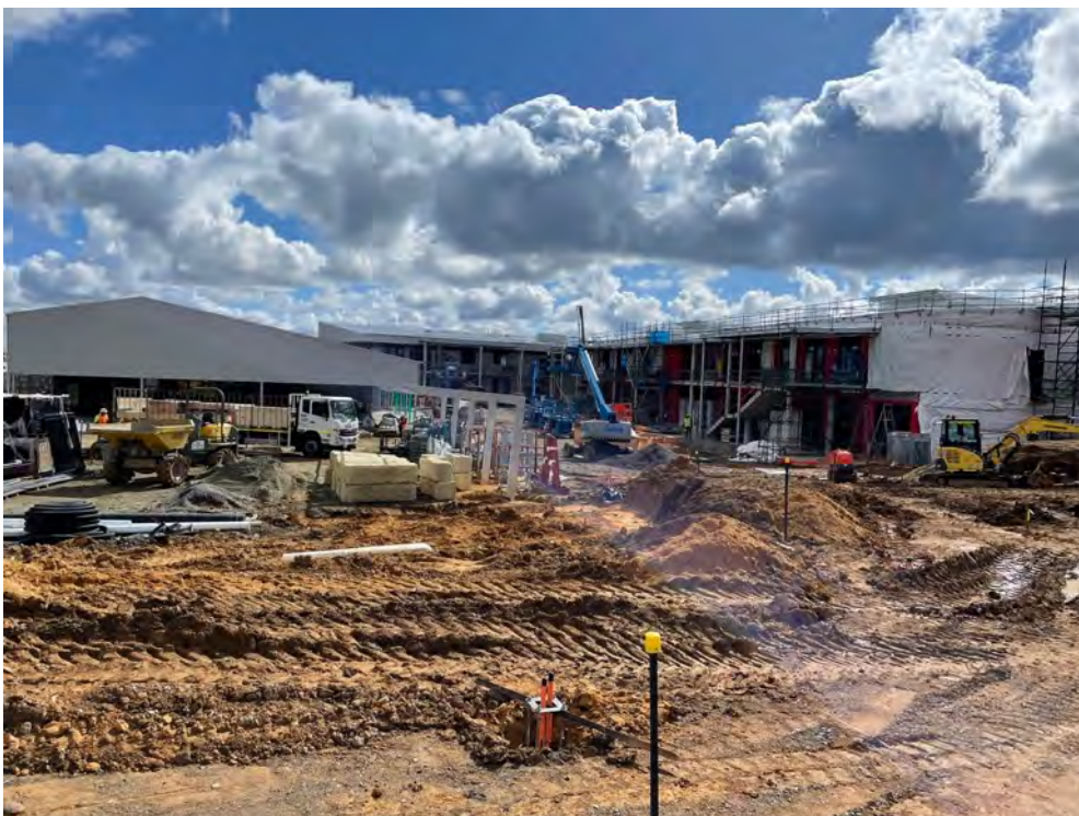
Photo 4 View of construction site looking north