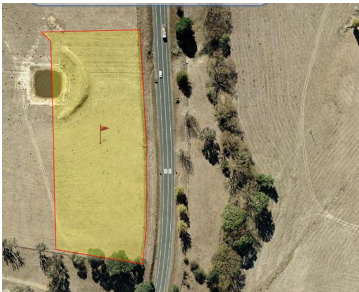
Figure 3-1 Aerial photograph of site showing boundary of SSD 11233241 (Six maps, February 2022)

Documentation relevant to the audit scope was made available pre-site audit for information and review. Follow-up documentation was provided post-site audit to address questions or items raised at the time of the site audit, during the closing meeting or identified in the draft audit findings.