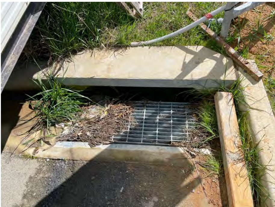
Photo 10 Unprotected stormwater drain behind site sheds