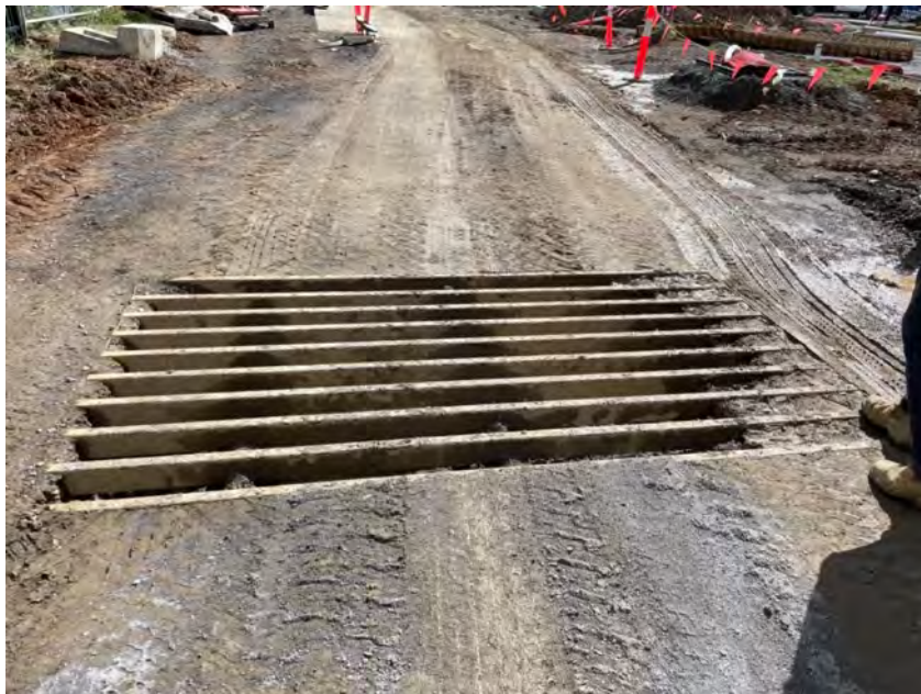
Photo 7 Entry/ exit point to site with rumble grid