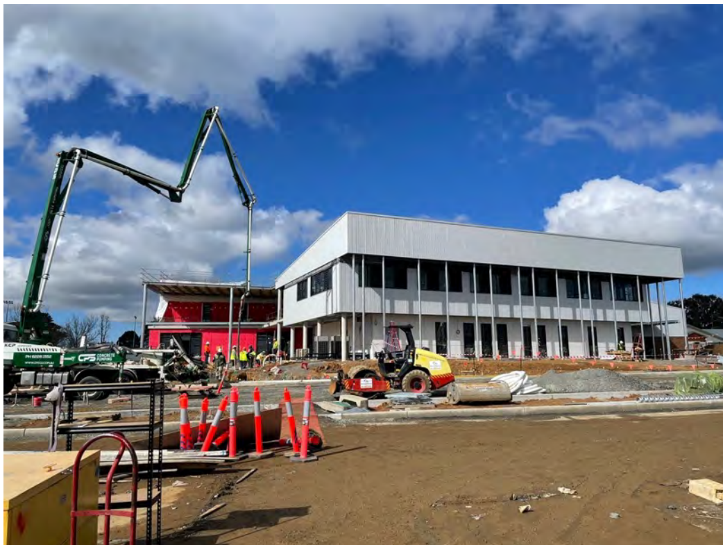
Photo 2 View of construction site looking south