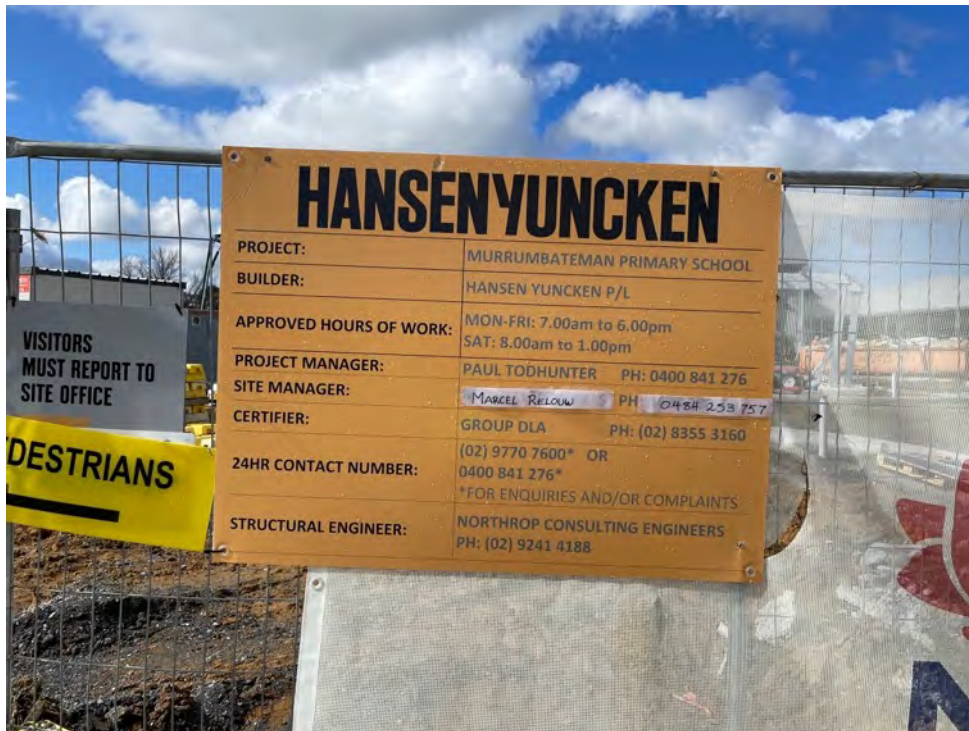
Photo 1 Site notice board as per CoC C1