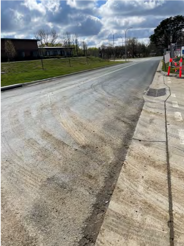
Photo 11 Mud tracking onto the public road