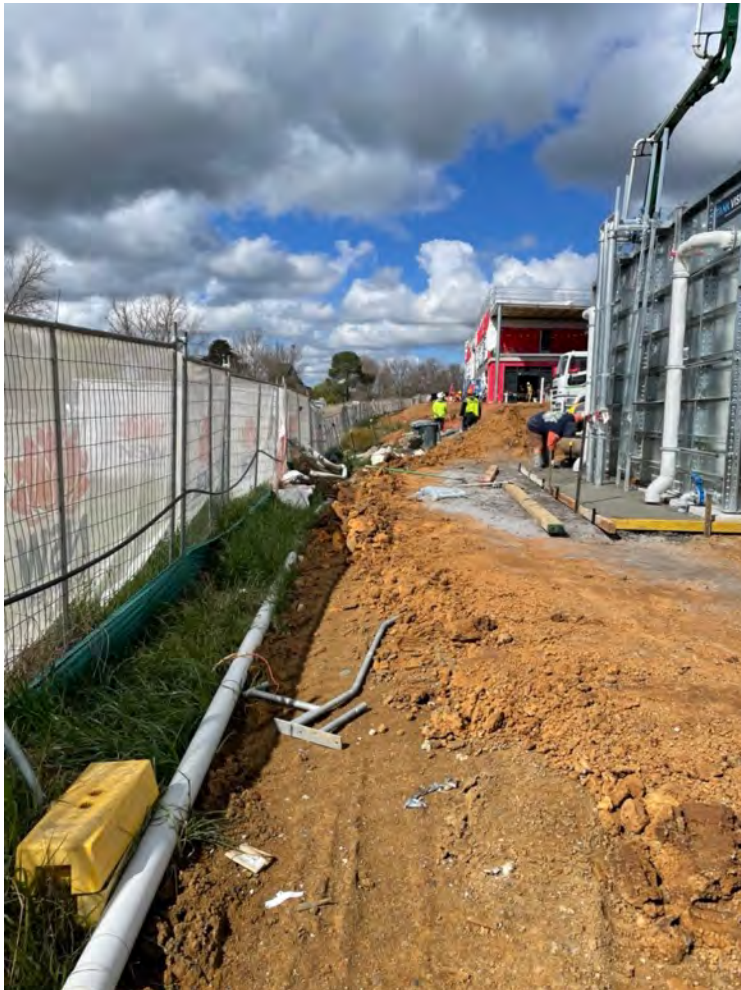
Photo 15 Sediment fencing along boundary