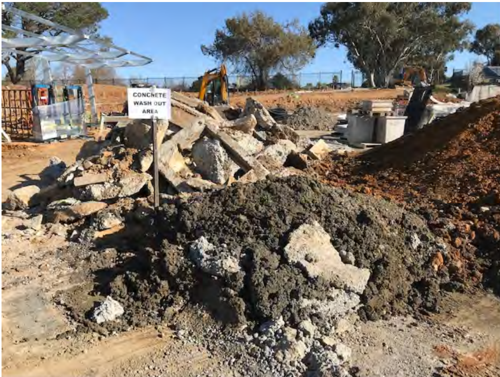
Photo 16 Designated concrete washout location