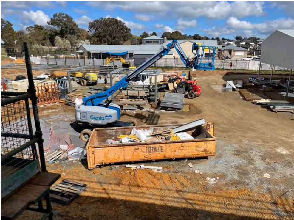
Photo 3 View of construction site looking west