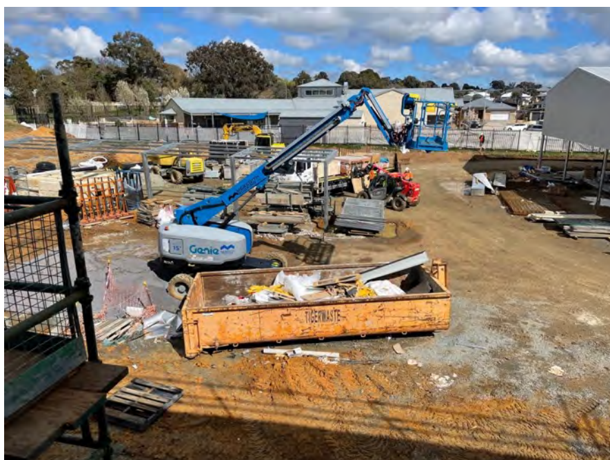
Photo 13 Waste skip bin in use