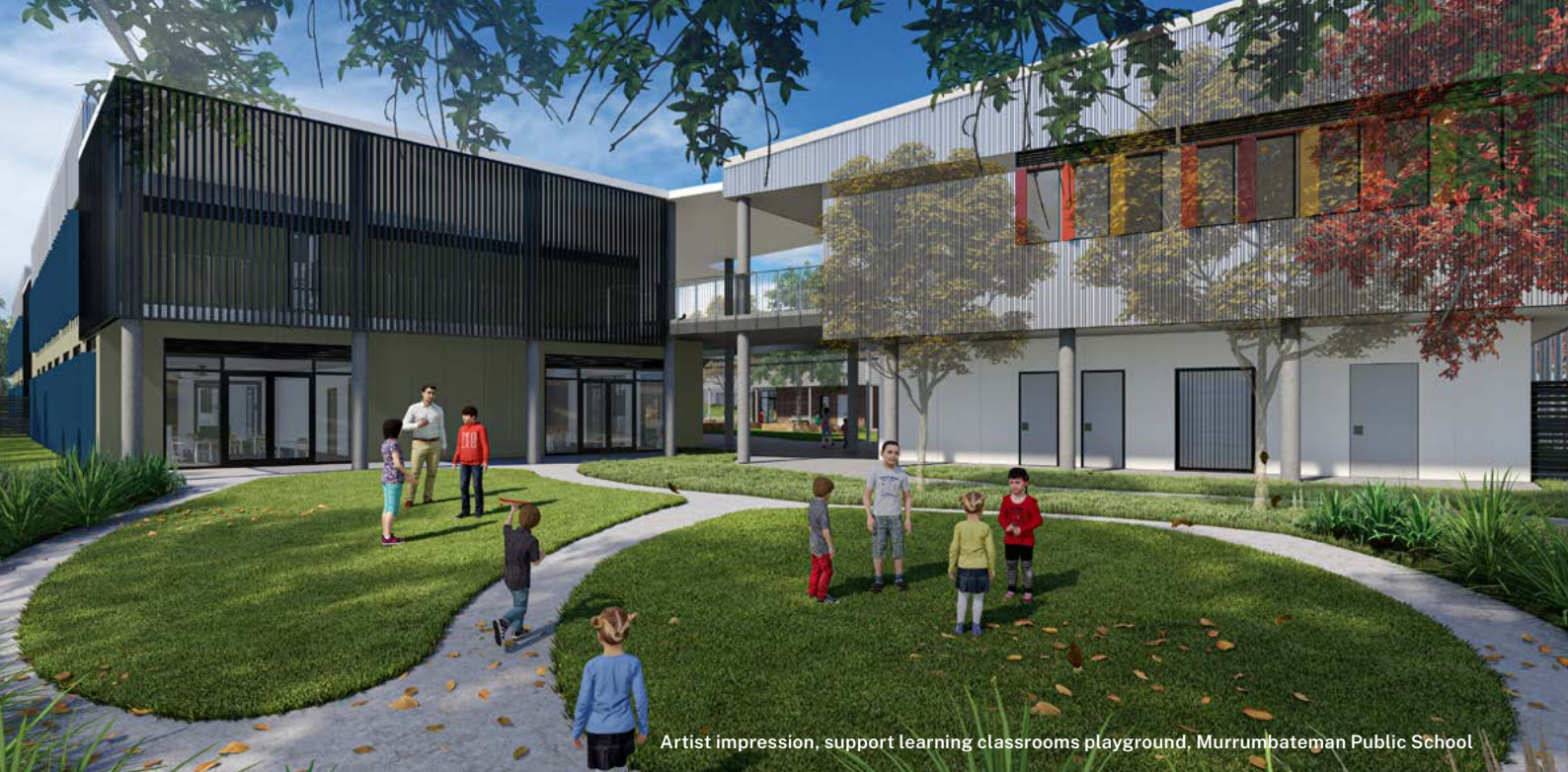
Artist impression, support learning classrooms playground, Murrumbateman Public School