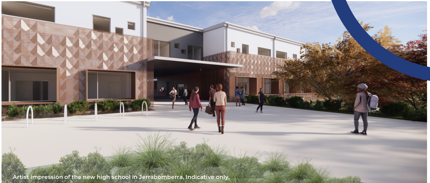
Artist impression of the new high school in Jerrabomberra. Indicative only.