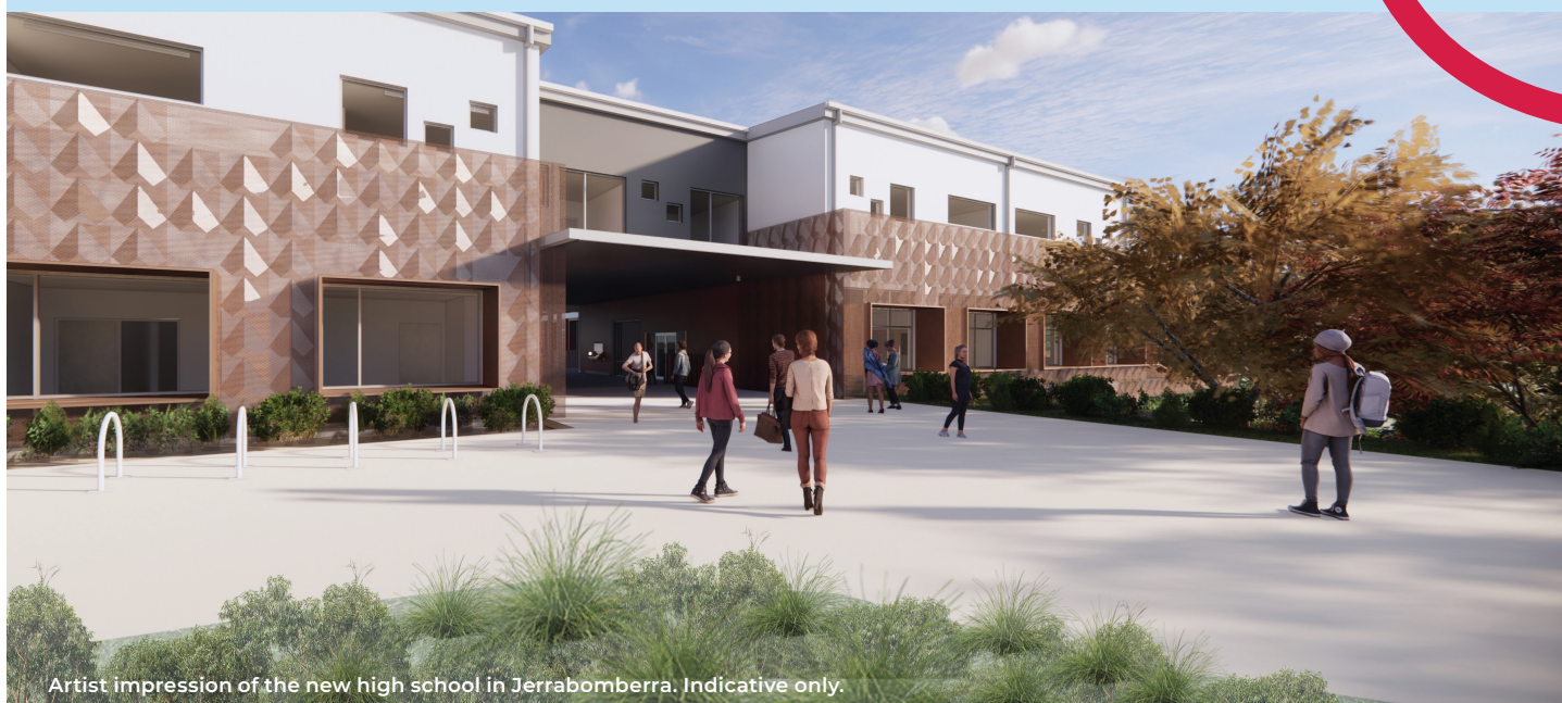
Artist impression of the new high school in Jerrabomberra. Indicative only.

Final preparations are underway prior to construction commencing of the new Jerrabomberra High School.