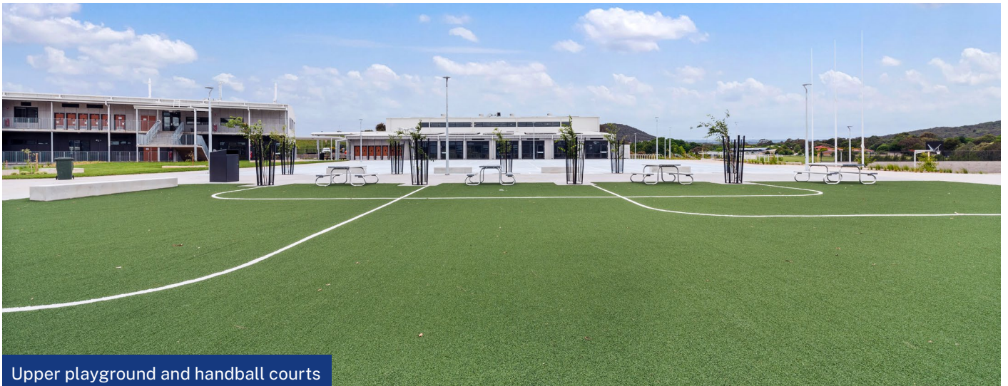
Upper playground and handball courts