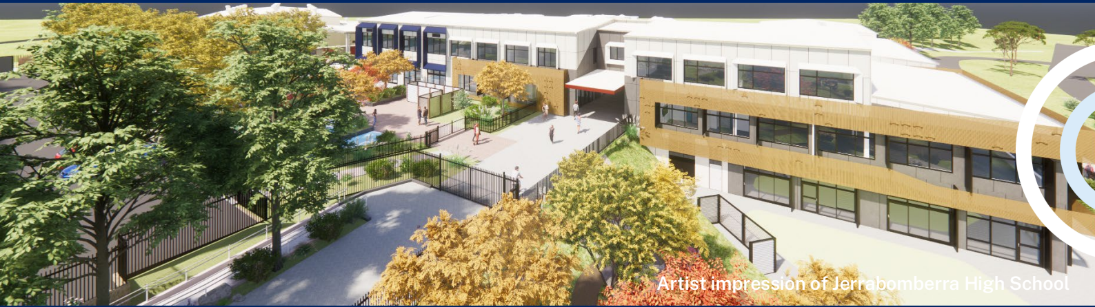
Artist impression of Jerrabomberra High School