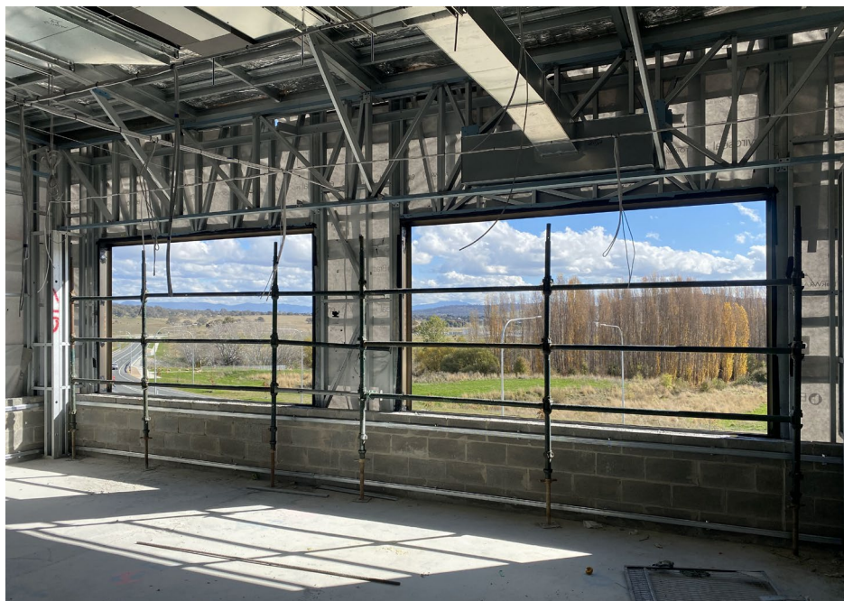
View from classrooms in Block A, looking out over Environa Drive.

A timelapse video of the construction of the new school from February to May 2023 can now be seen on the project webpage at https://www.schoolinfrastructure.nsw.gov.au/projects/n/new-high-school-in-jerrabomberra.html