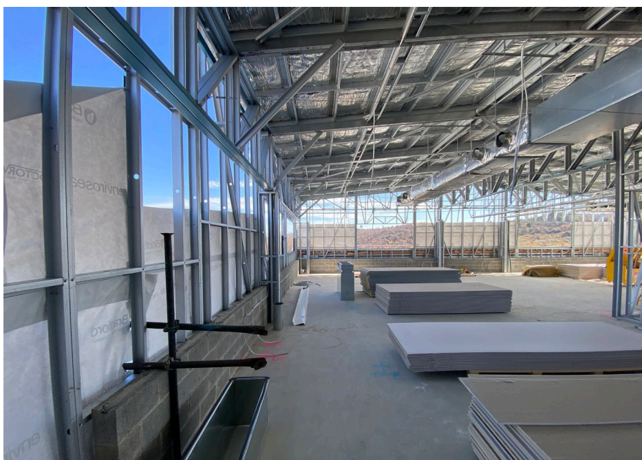
Inside Block B, in the space that will be the school library.