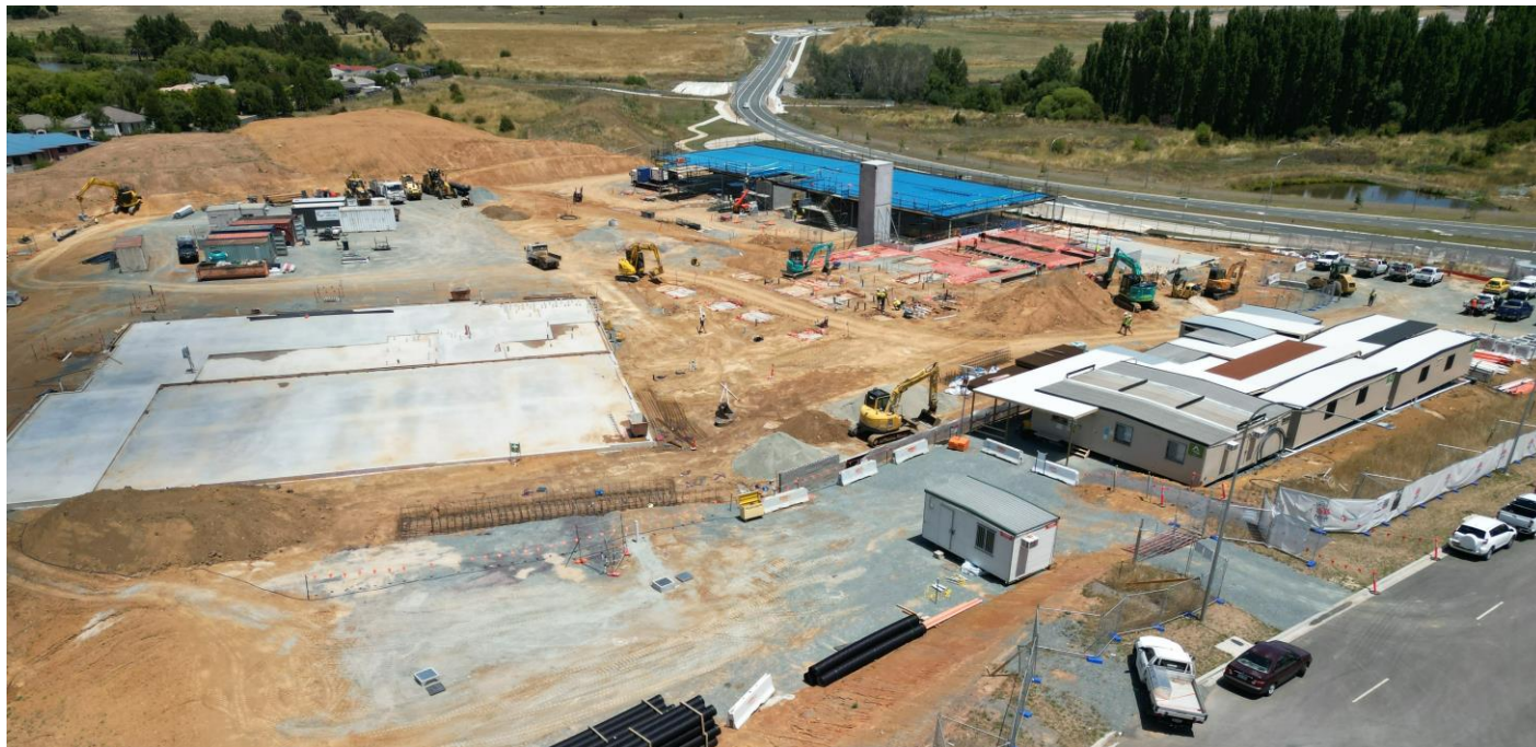
Ground floor concrete slab of block C (left) has been poured. Structural steel frames for Block A and B have been installed (centre).

The lower ground floor concrete slabs have been completed for Blocks A and B, and the structural steel frames installed. The ground floor concrete slab has been poured for Block C. The retaining wall for the library, which sits between Block A and B, has been finished, and the retaining wall behind the sports courts is being constructed.