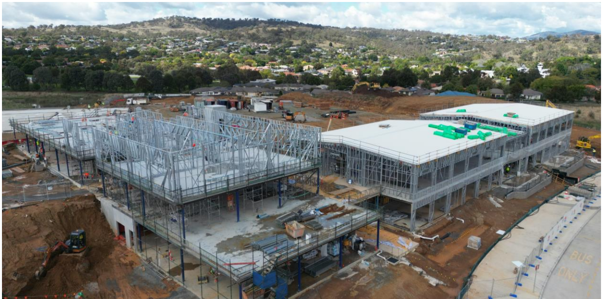
Progress on Block B (left) and Block A (right)

The design changes to incorporate an additional science laboratory are being worked through. The installation of roofing and cladding of Block A, which will house general learning spaces (GLS), shared learning spaces, wood workshop, metal workshop and a visual arts workshop is ongoing. The structural steel is being installed in Block B which will contain the library, school administration, semi-commercial kitchen, food and textiles and GLS. Roofing of Block B will begin this month.