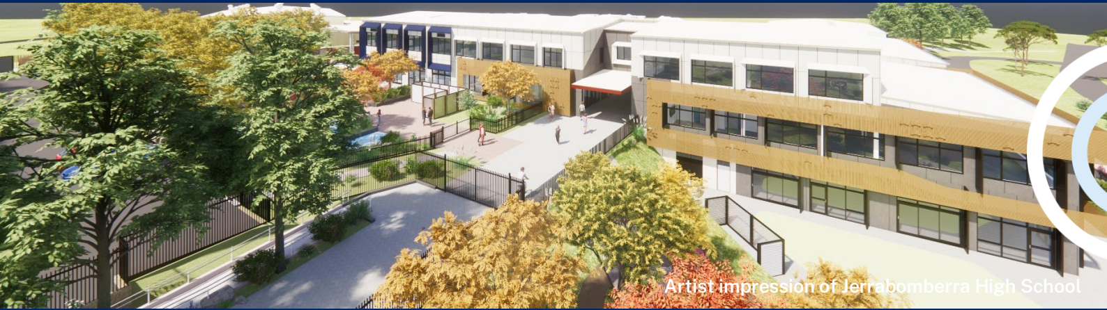
Artist impression of Jerrabomberra High School