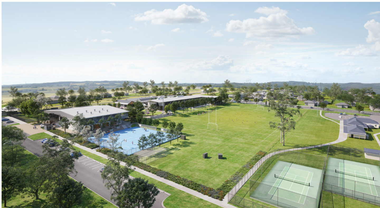
Looking across Mick Sherd Oval to the high school, with the new high school sports courts on the left.