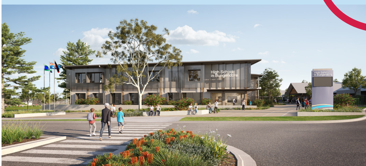
Artist impression of the new high school in Bungendore. Indicative only and subject to change.

The NSW Government is investing $7.9 billion over the next four years, continuing its program to deliver 215 new and upgraded schools to support communities across NSW. This is the largest investment in public education infrastructure in the history of NSW.