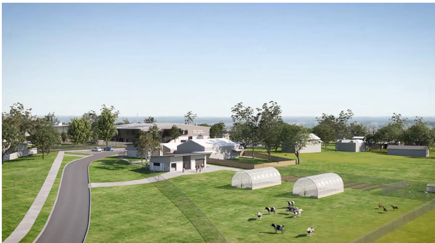
Looking across the proposed agricultural plot (off Turallo Terrace, adjacent to the existing 1st Bungendore Scout hall).

All artist impressions are indicative only and subject to change.