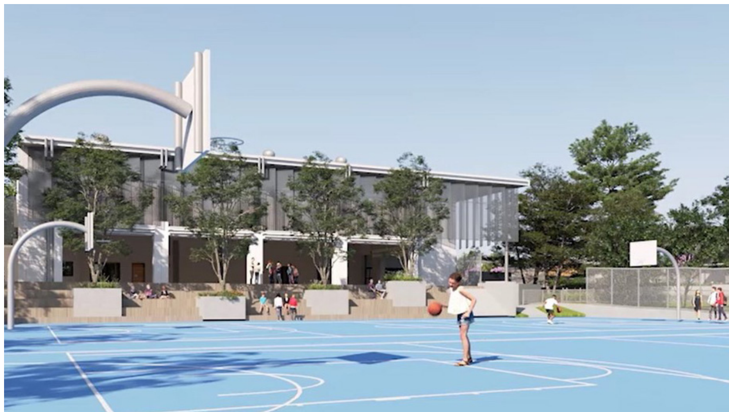
View across the proposed new high school's sports courts.

All artist impressions are indicative only and subject to change.