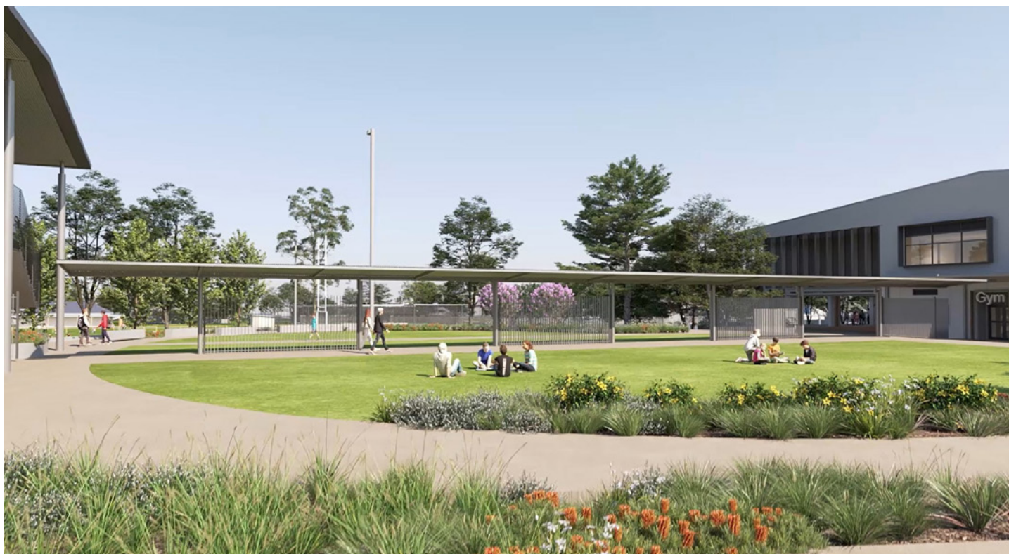
Artist impression of the proposed school quadrangle, looking toward Mick Sherd Oval.