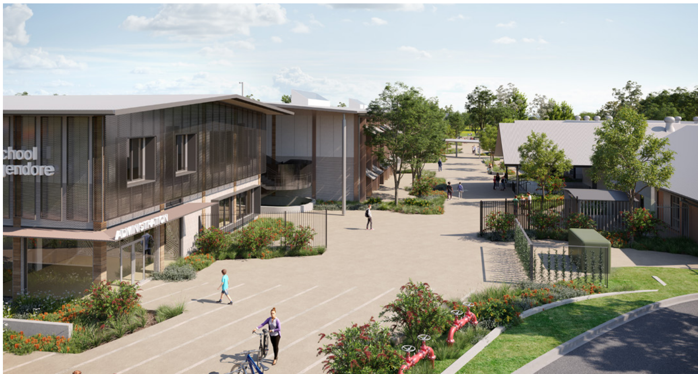
Artist impression of the proposed school plaza with refurbished former Queanbeyan-Palerang Regional Council buildings on the right.

All artist impressions are indicative only and subject to change.