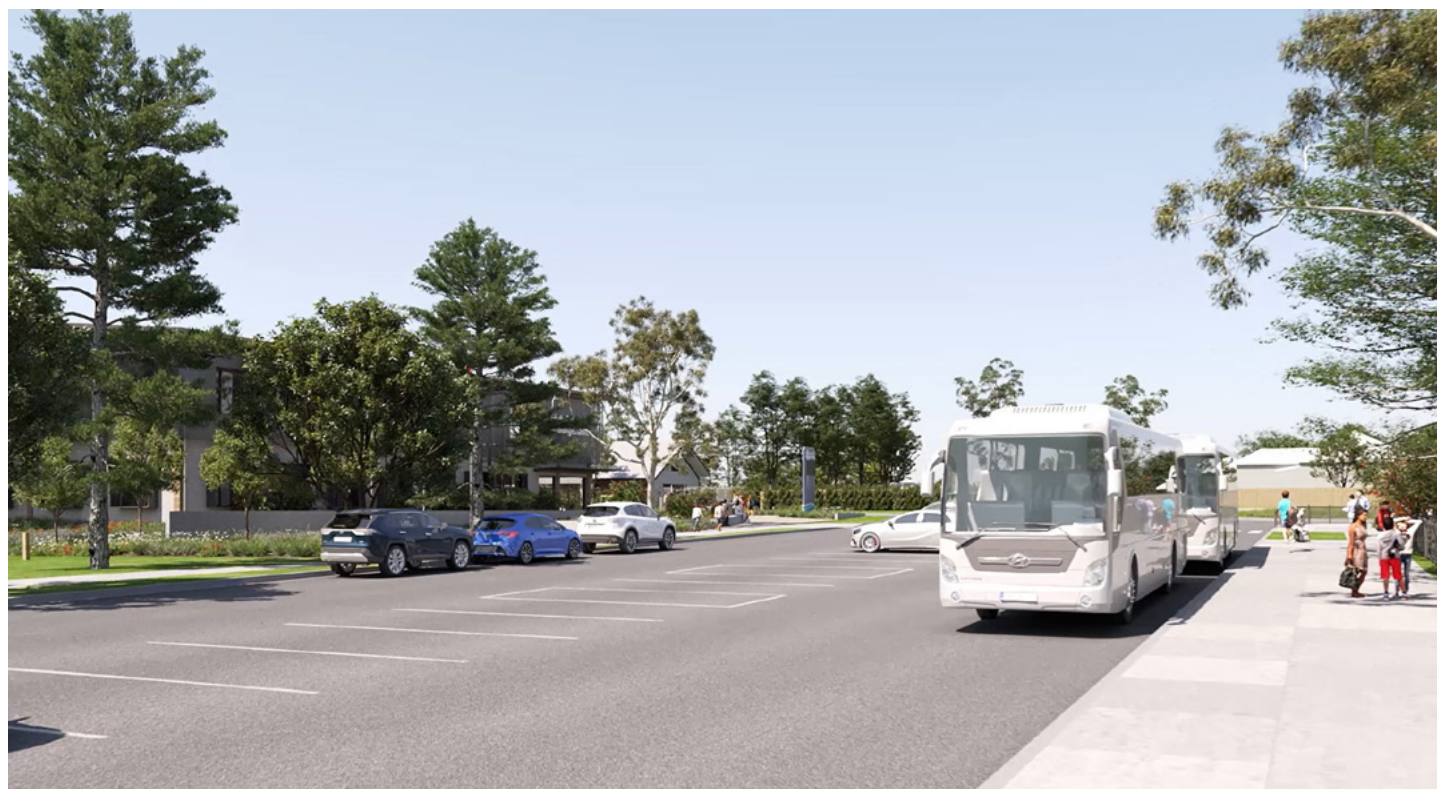
Looking across Gibraltar Street from the Public School to the proposed new high school.