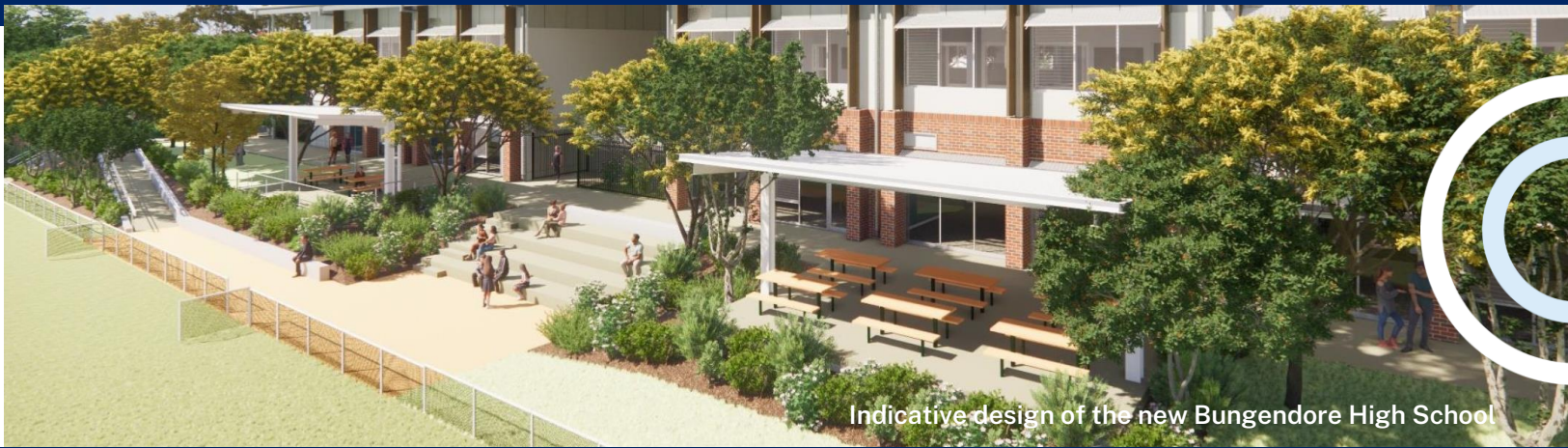
Indicative design of the new Bungendore High School