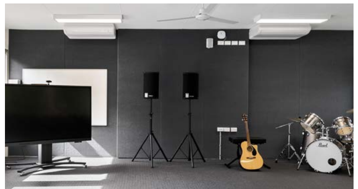
Learning spaces at Bungendore High School