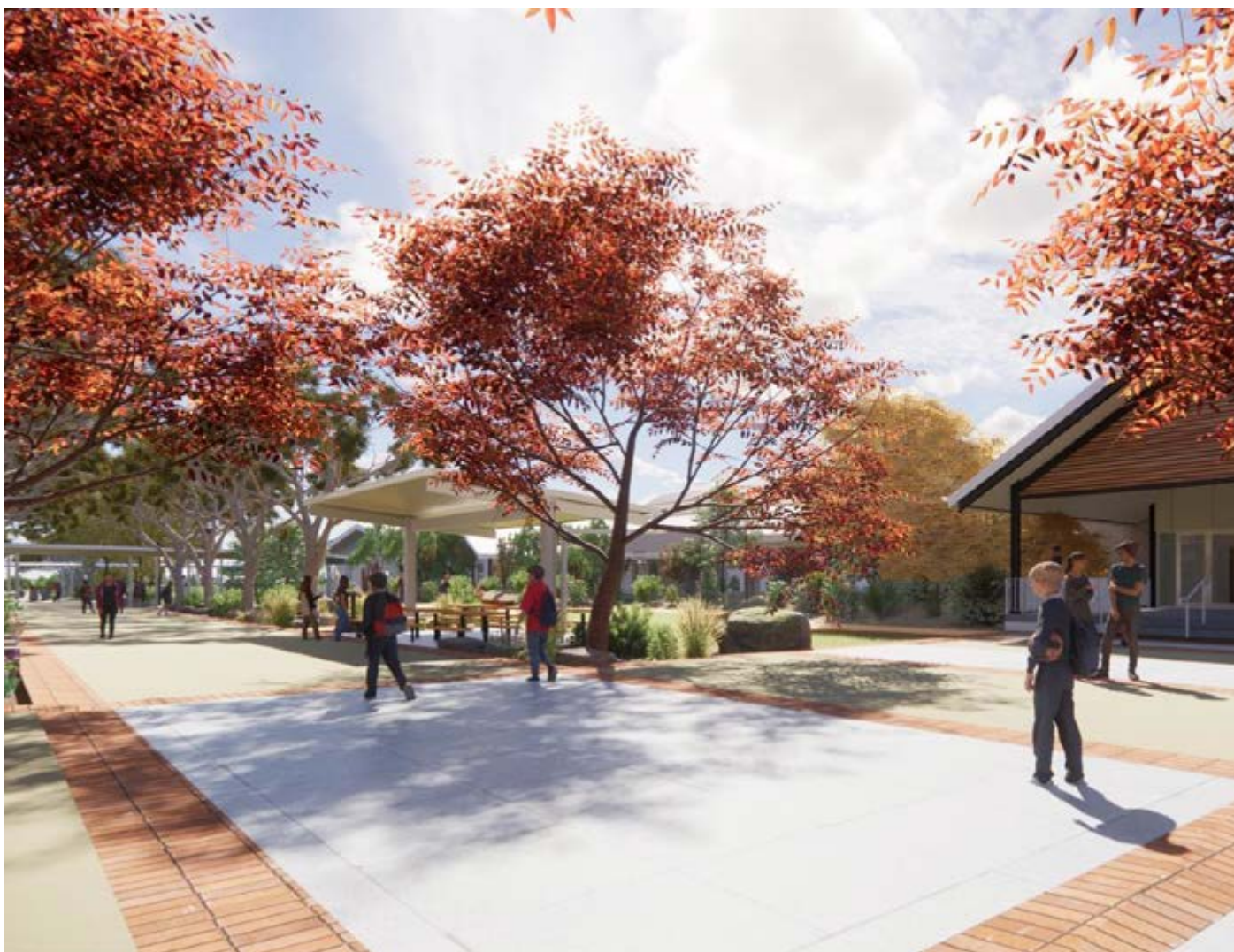
Artist impression of Bungendore High School. Indicative only.

The contractor will soon mobilise to start works on the new high school. We will notify the community ahead of works starting.