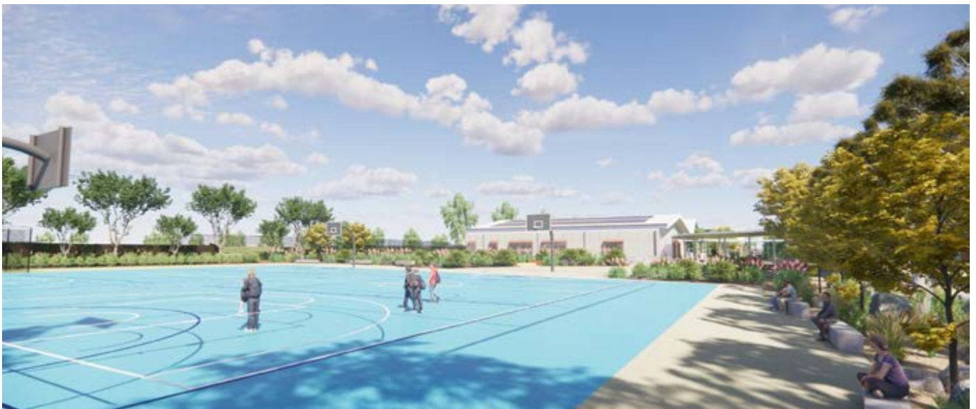
Artist impression of Bungendore High School. Indicative only.