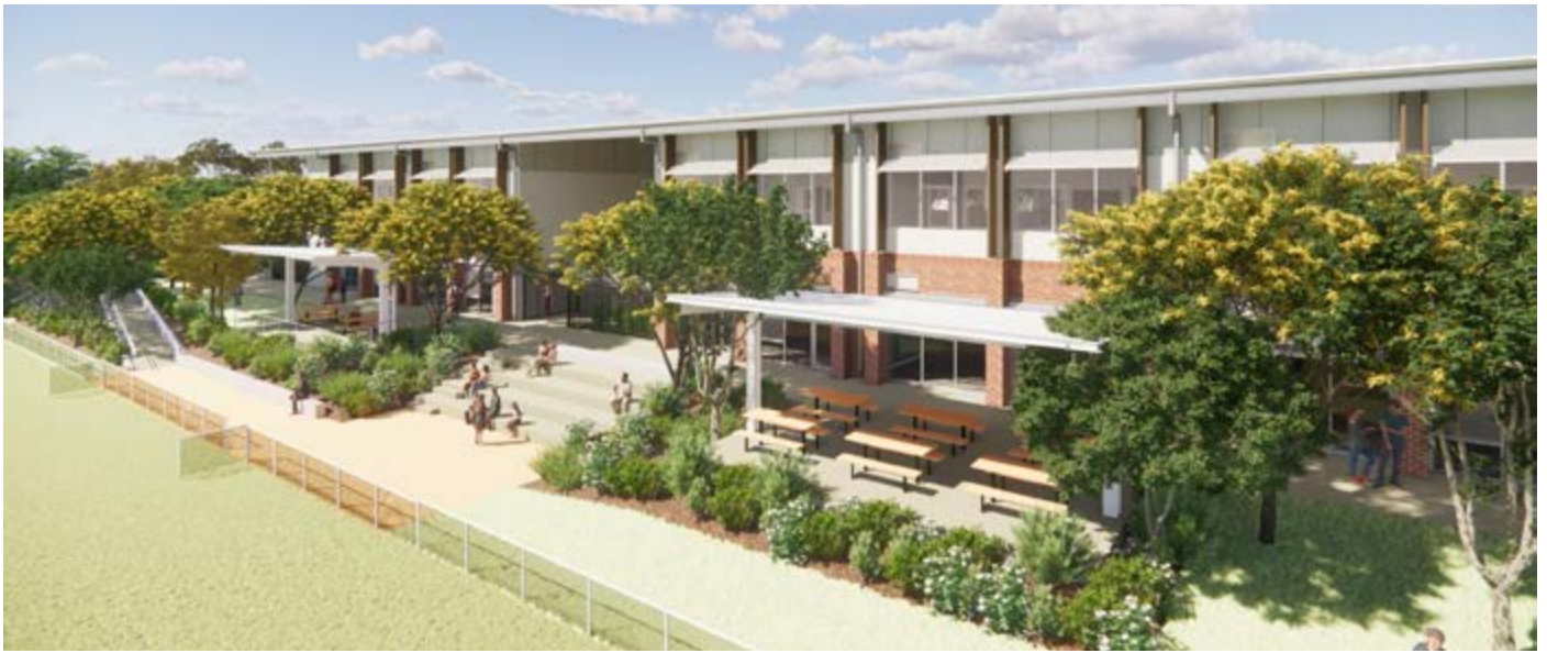
Artist impression of Bungendore High School. Indicative only.