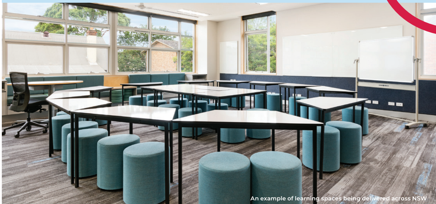
An example of learning spaces being delivered across NSW

The NSW Government is investing $8.6 billion in school infrastructure over the next four years, continuing its program to deliver 160 new and upgraded schools to support communities across NSW. This builds on the more than $9.1 billion invested in projects delivered since 2017, a program of $17.7 billion in public education infrastructure.