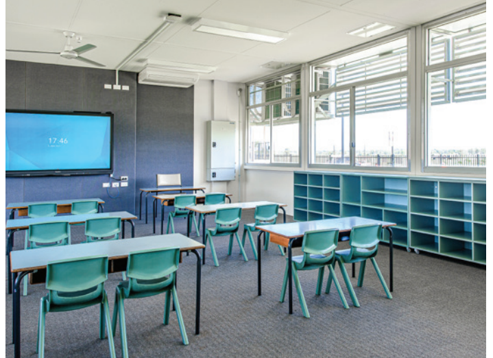
Example of temporary buildings used in NSW schools