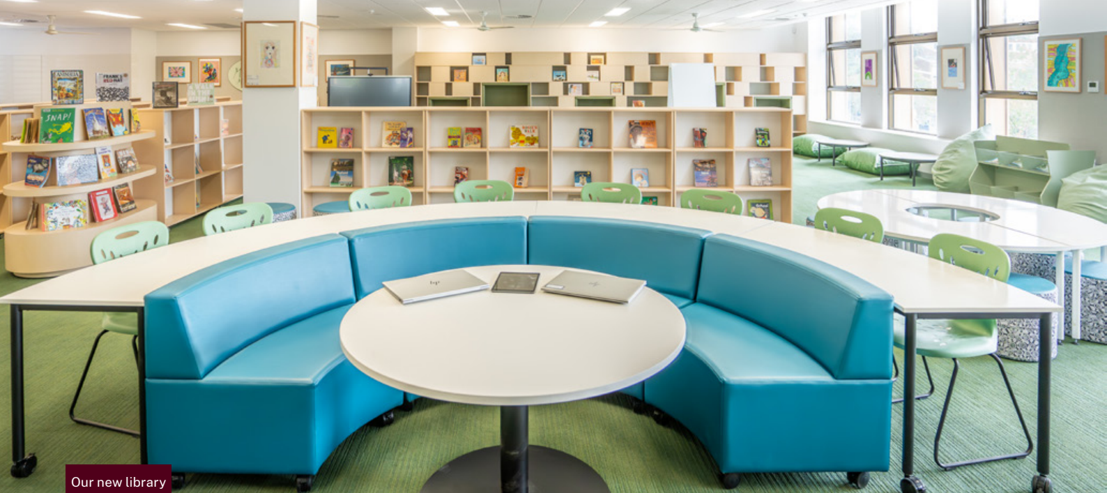
Our new library