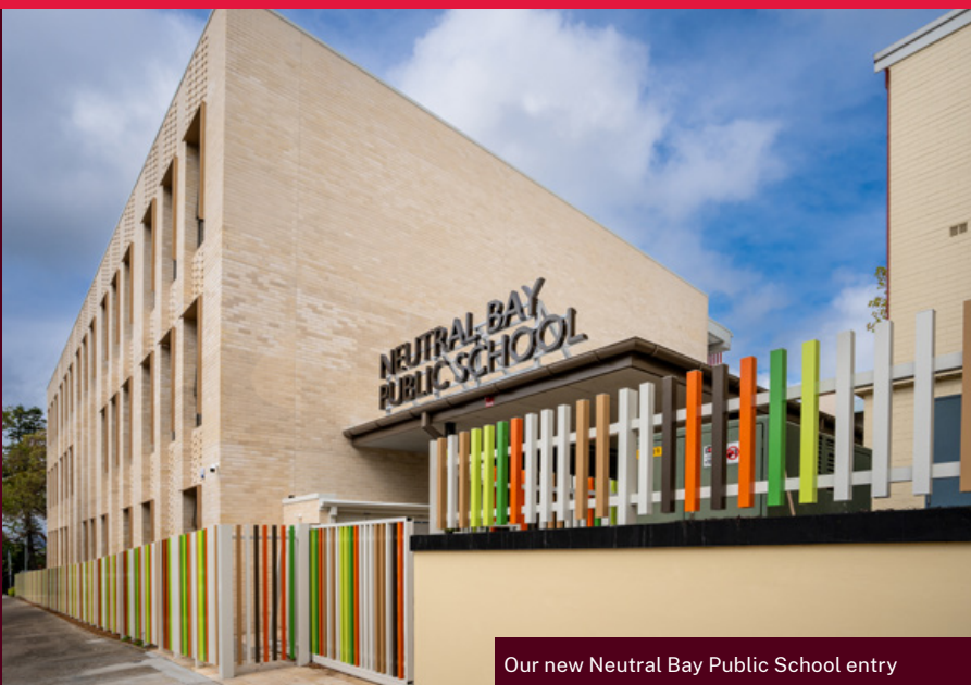
Our new Neutral Bay Public School entry