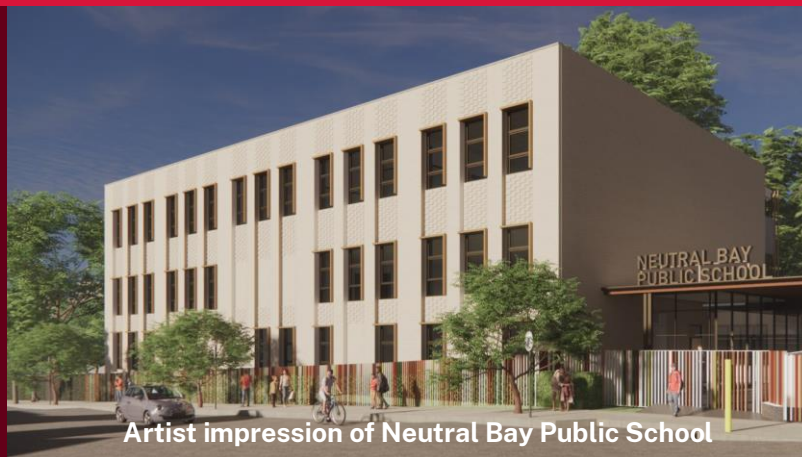
Artist impression of Neutral Bay Public School