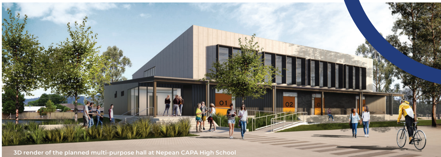
3D render of the planned multi-purpose hall at Nepean CAPA High School