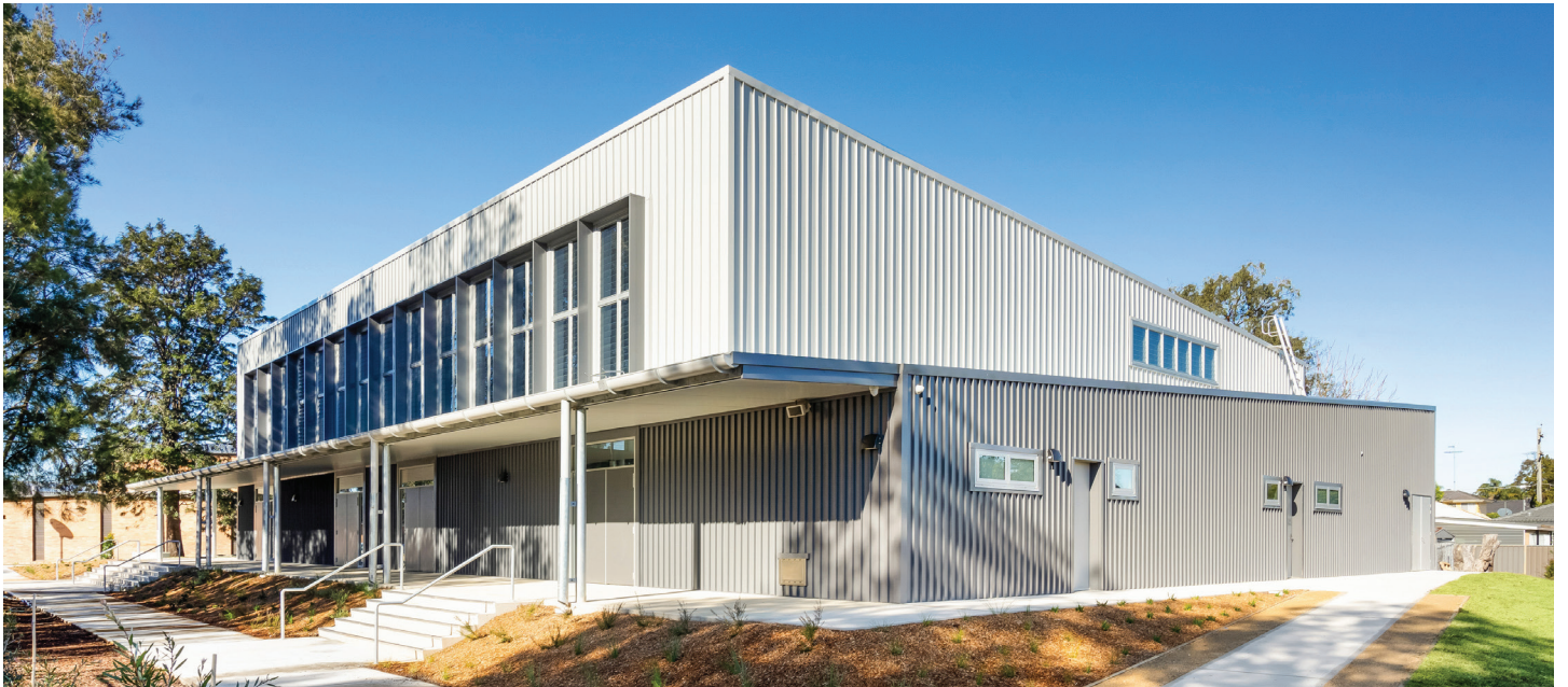
External view of new multi-purpose hall