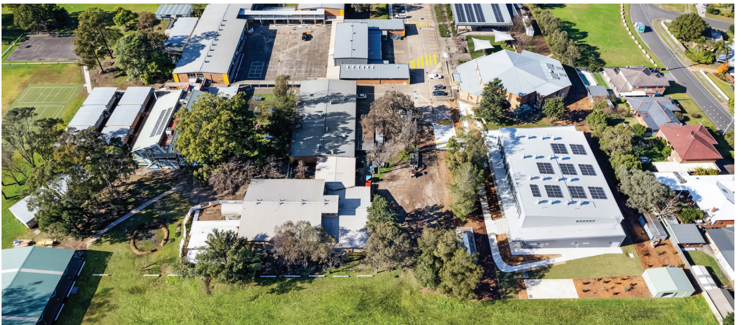
Aerial view of Nepean Creative and Performing Arts High School