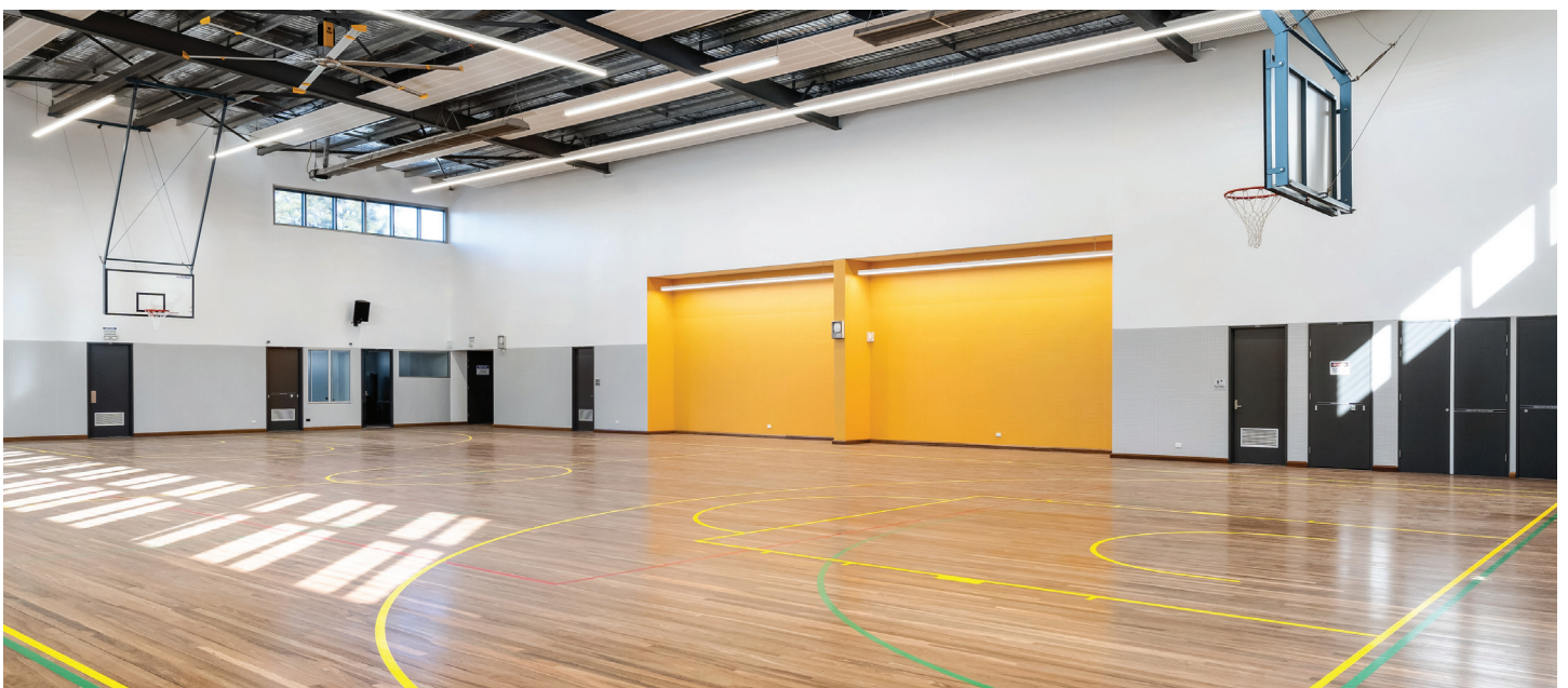
Image of basketball court in new multi-purpose hall