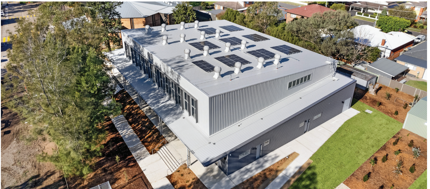
Aerial view of new multi-purpose hall