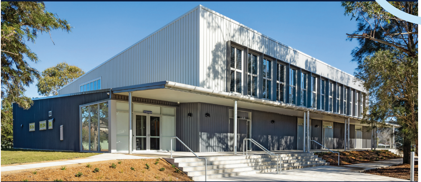
Front entrance of new multi-purpose hall