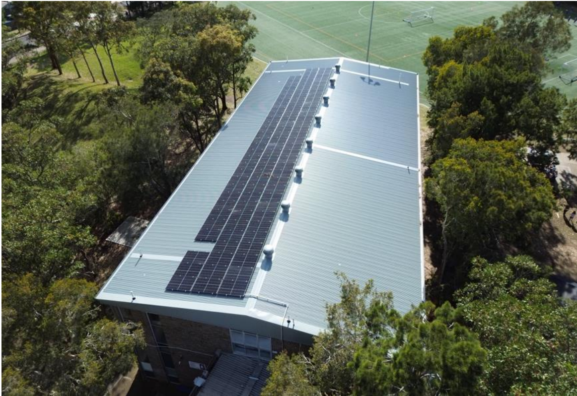
Above: new roof on Block E