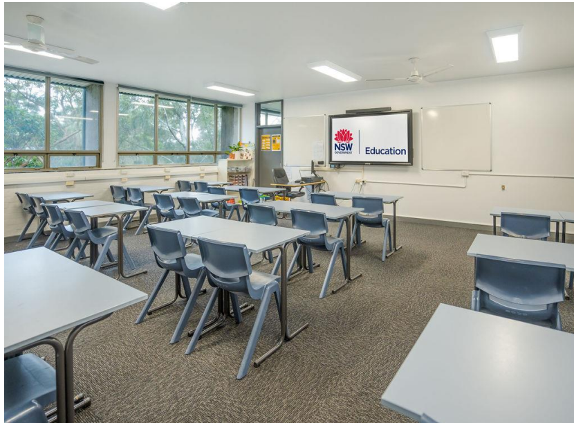
Above: Refurbished classroom

The project team is working closely with school leadership to understand the school's needs in completing design work.