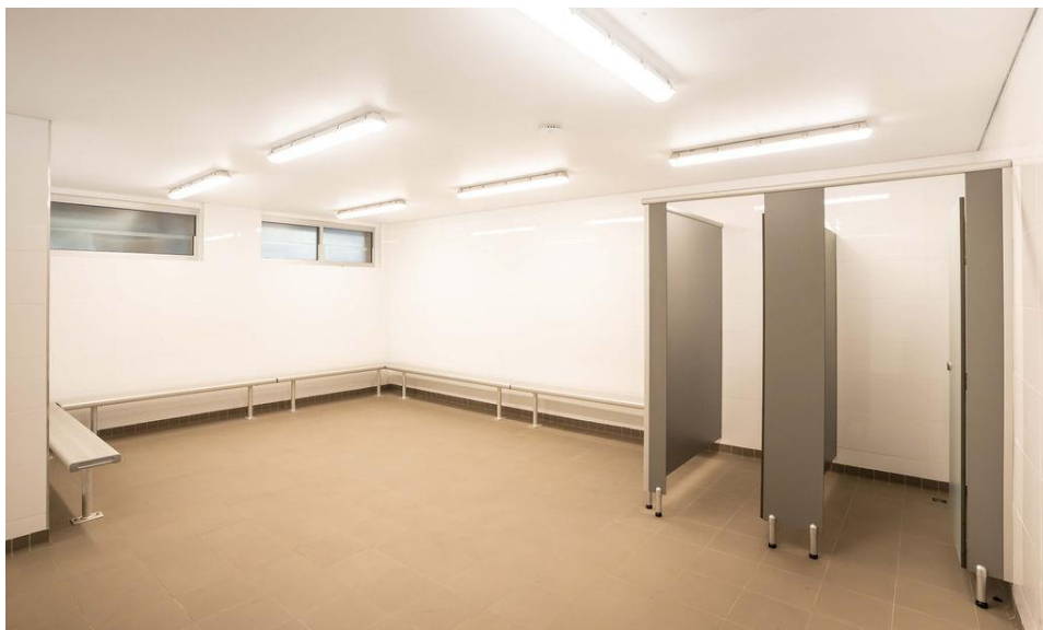
Below: upgraded toilets and change rooms in Block A

If you have any queries about the project, contact us in business hours via the contact details below. For the latest information visit edu.nsw.link/NSHS or scan the QR code.