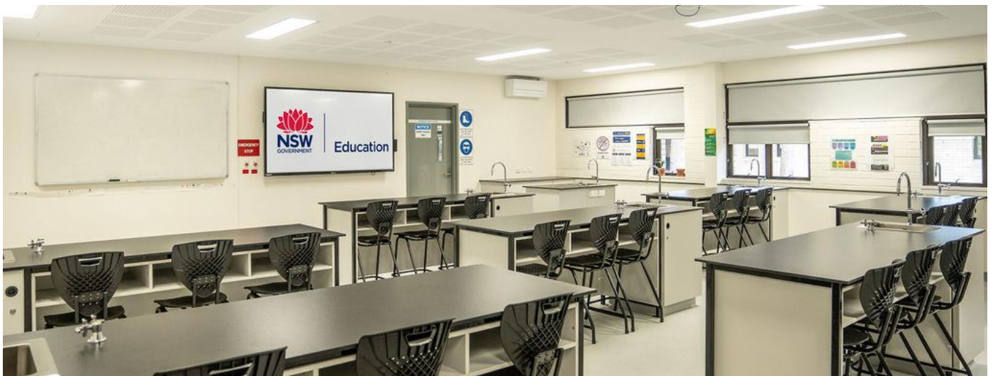
Above: Refurbished science labs to enhance student learning

The project also includes upgrades to the technological and applied studies (TAS) classrooms and student and staff amenities in Block A, renewal of the science labs, prep rooms, and chemical storerooms in Block B, and the replacement of roofs in Blocks B, C, D, and E, and part of Block A.