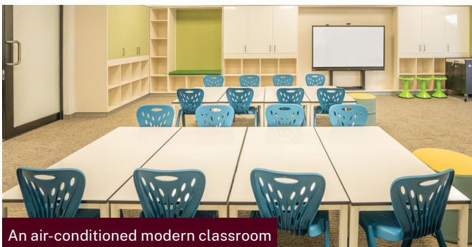
An air-conditioned modern classroom

School Infrastructure NSW and Narrabeen North Public School