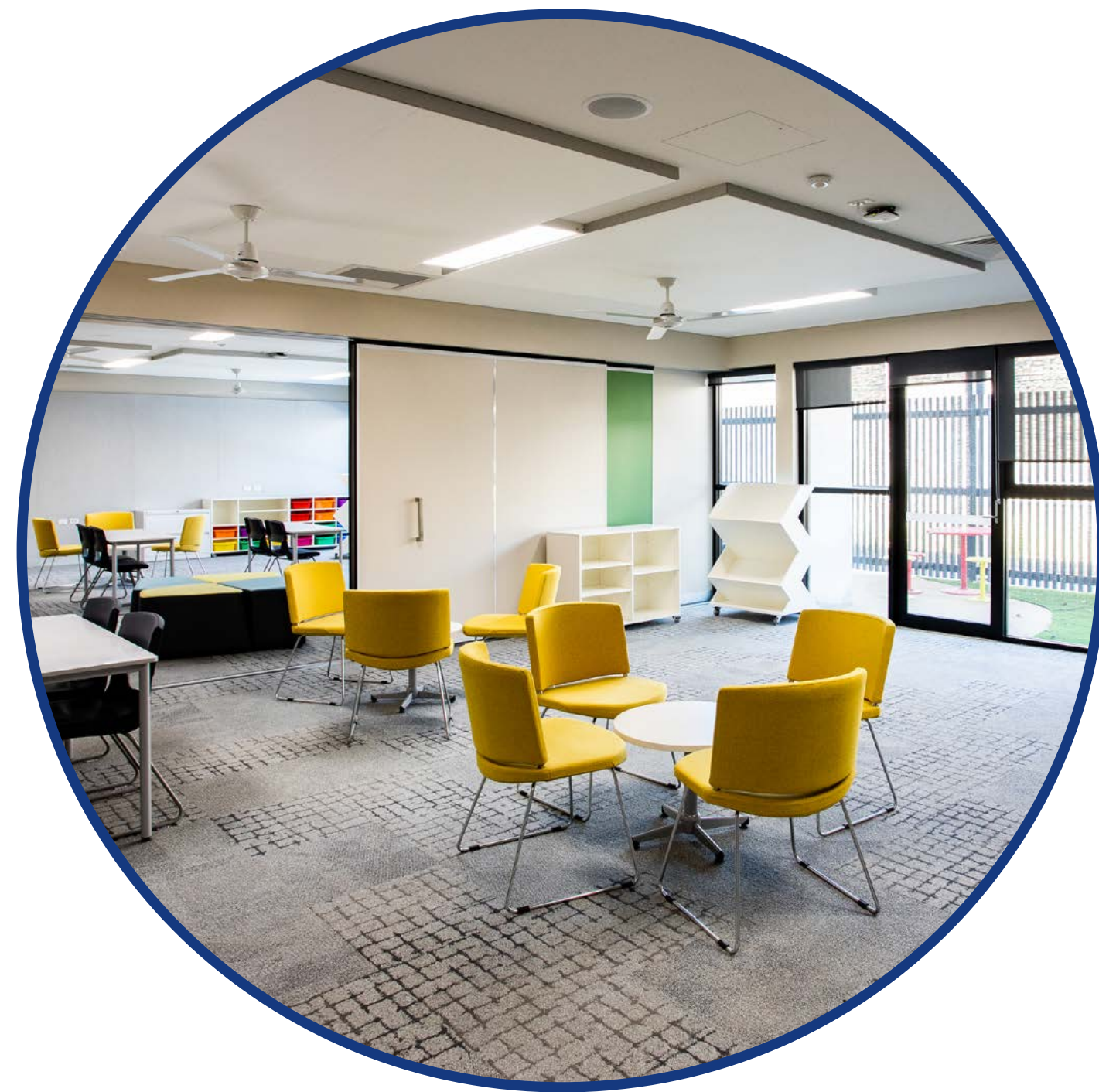
New classrooms for specialist support classes

The upgrade at Narrabeen North Public School will feature: