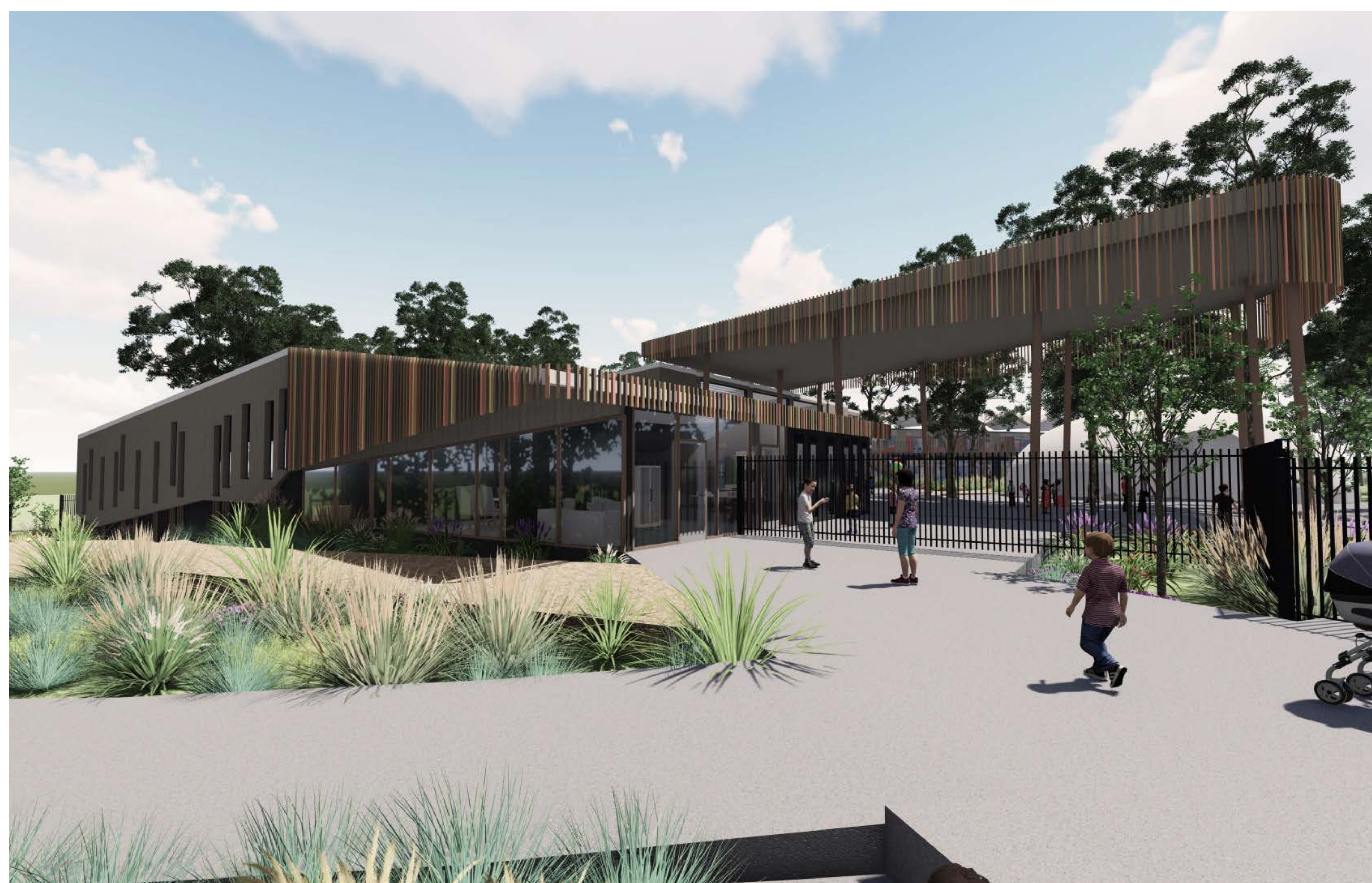
Artist impression of the new hall and administration hub at Narrabeen North Public School

The artist impressions are from the concept design stage and are subject to change.