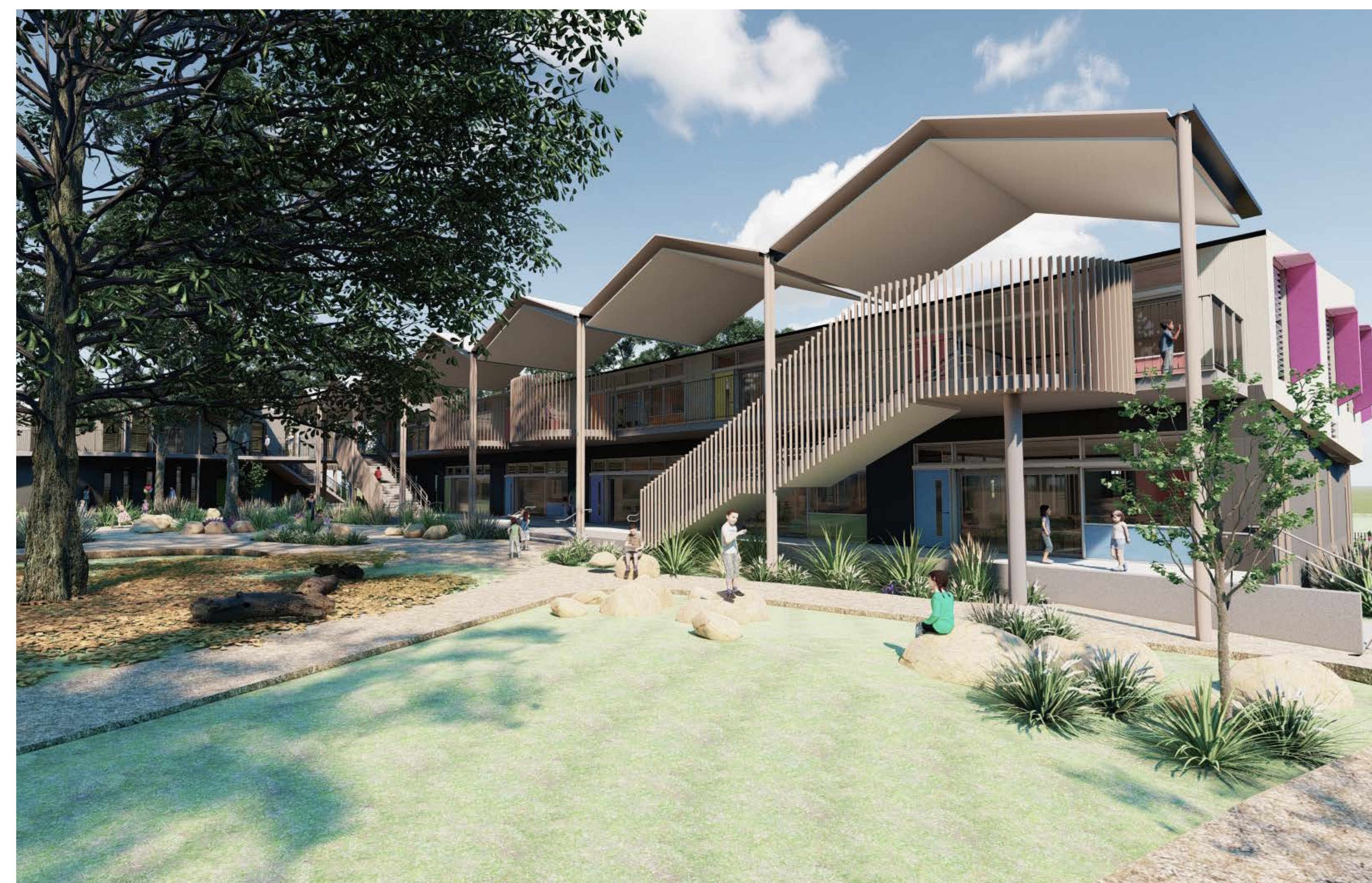
Artist impression of the new classrooms at Narrabeen North Public School