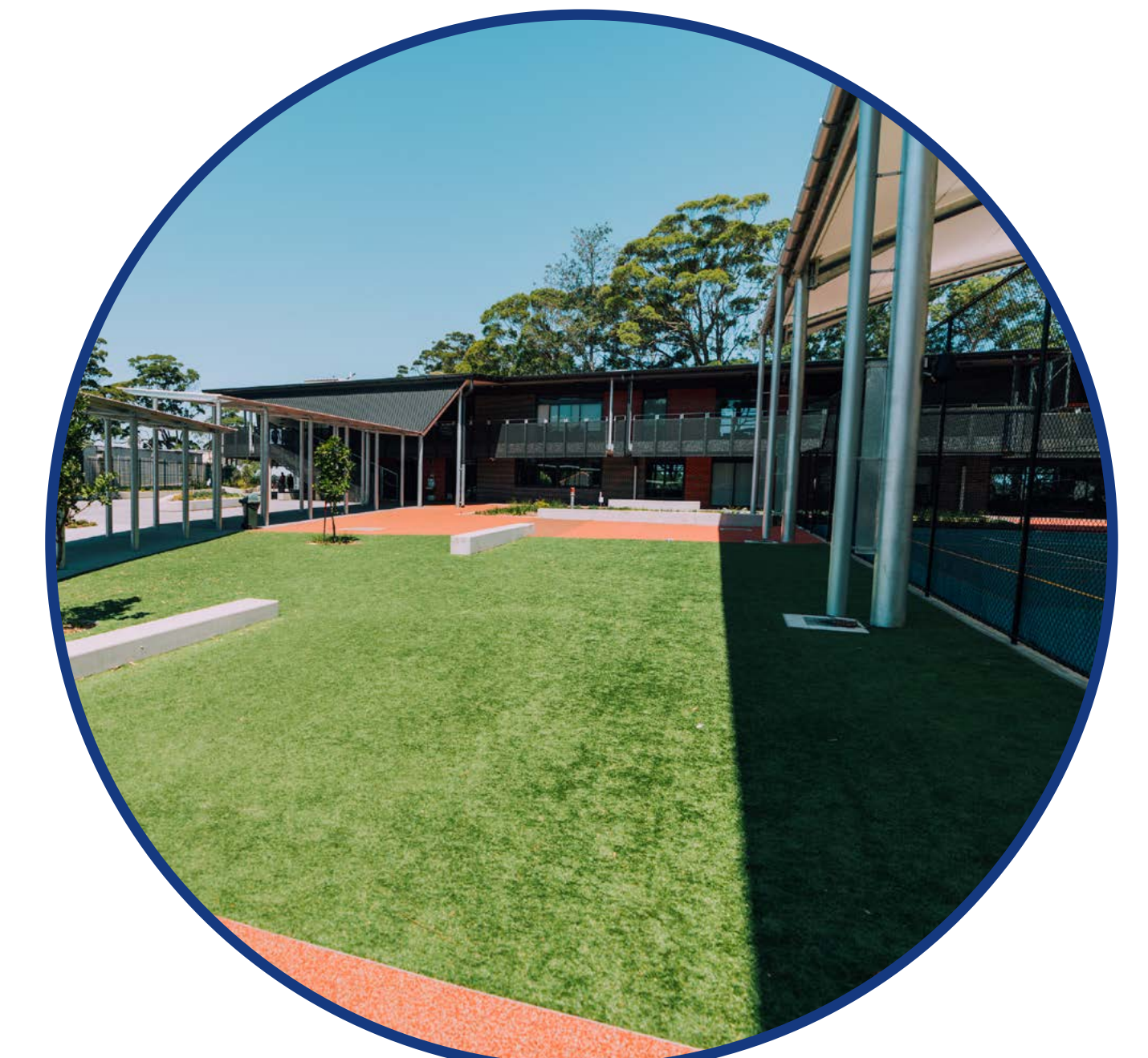
New administration hub