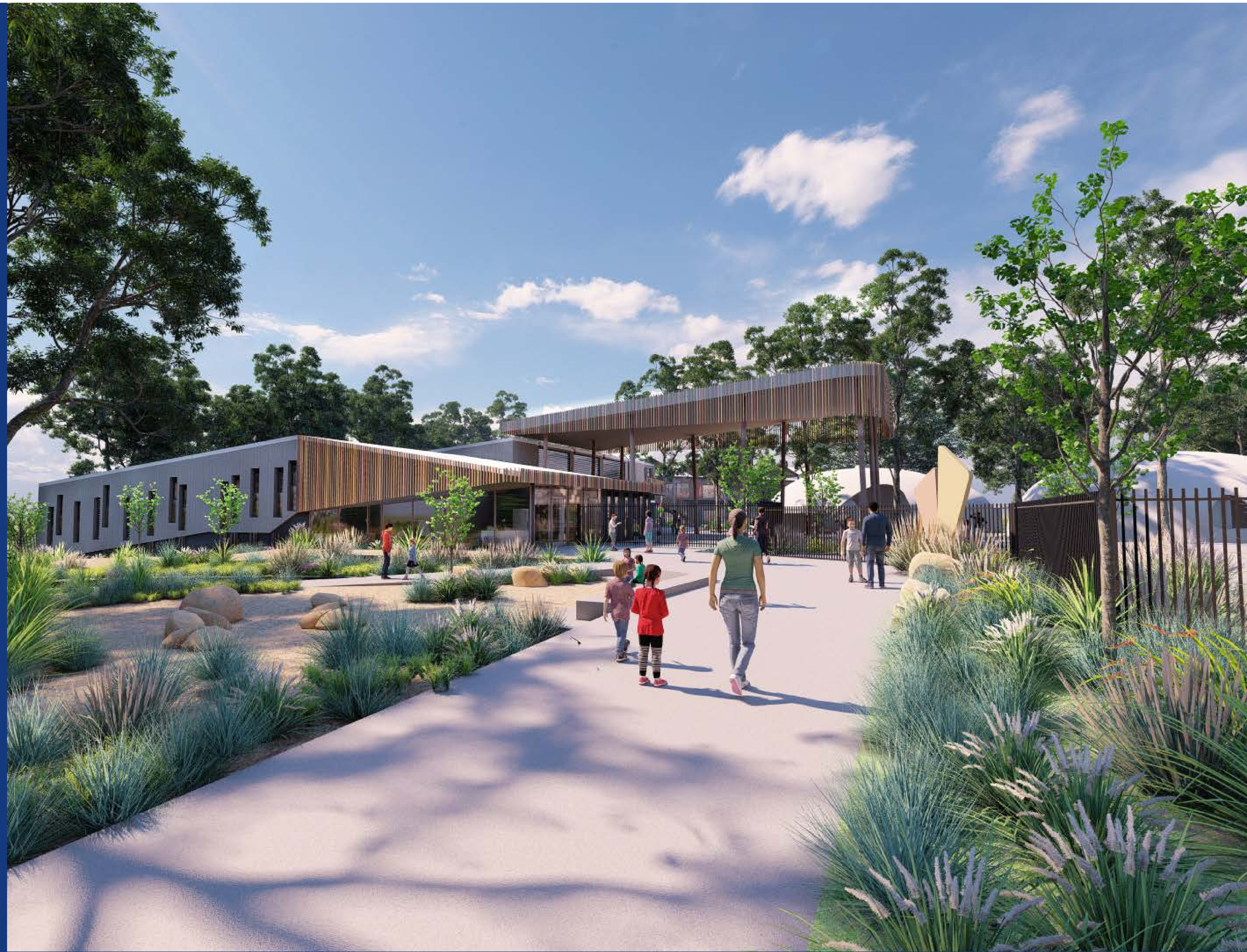
Artist impression of the new hall and administration hub at Narrabeen North Public School