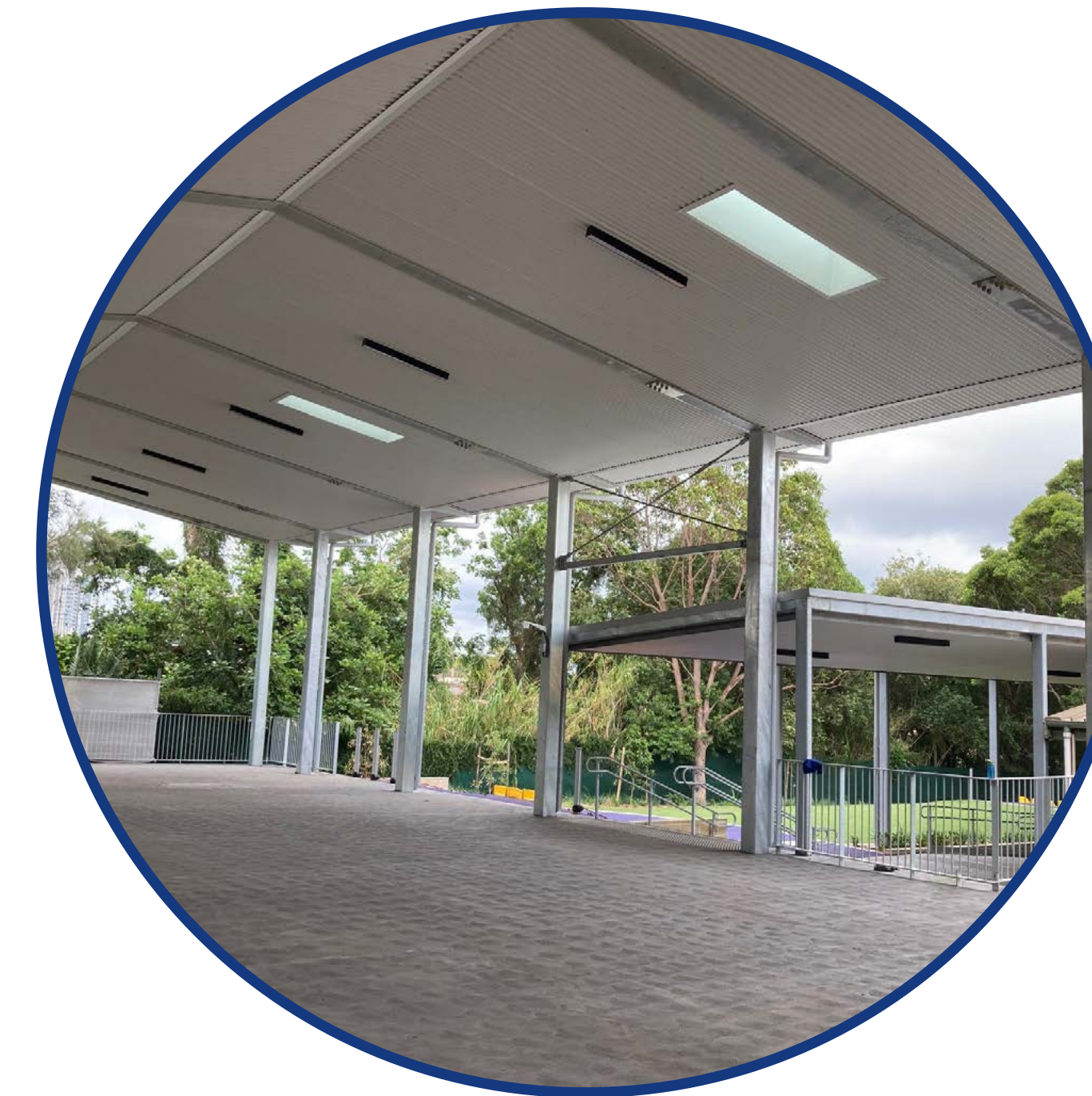
Covered outdoor learning area (COLA)