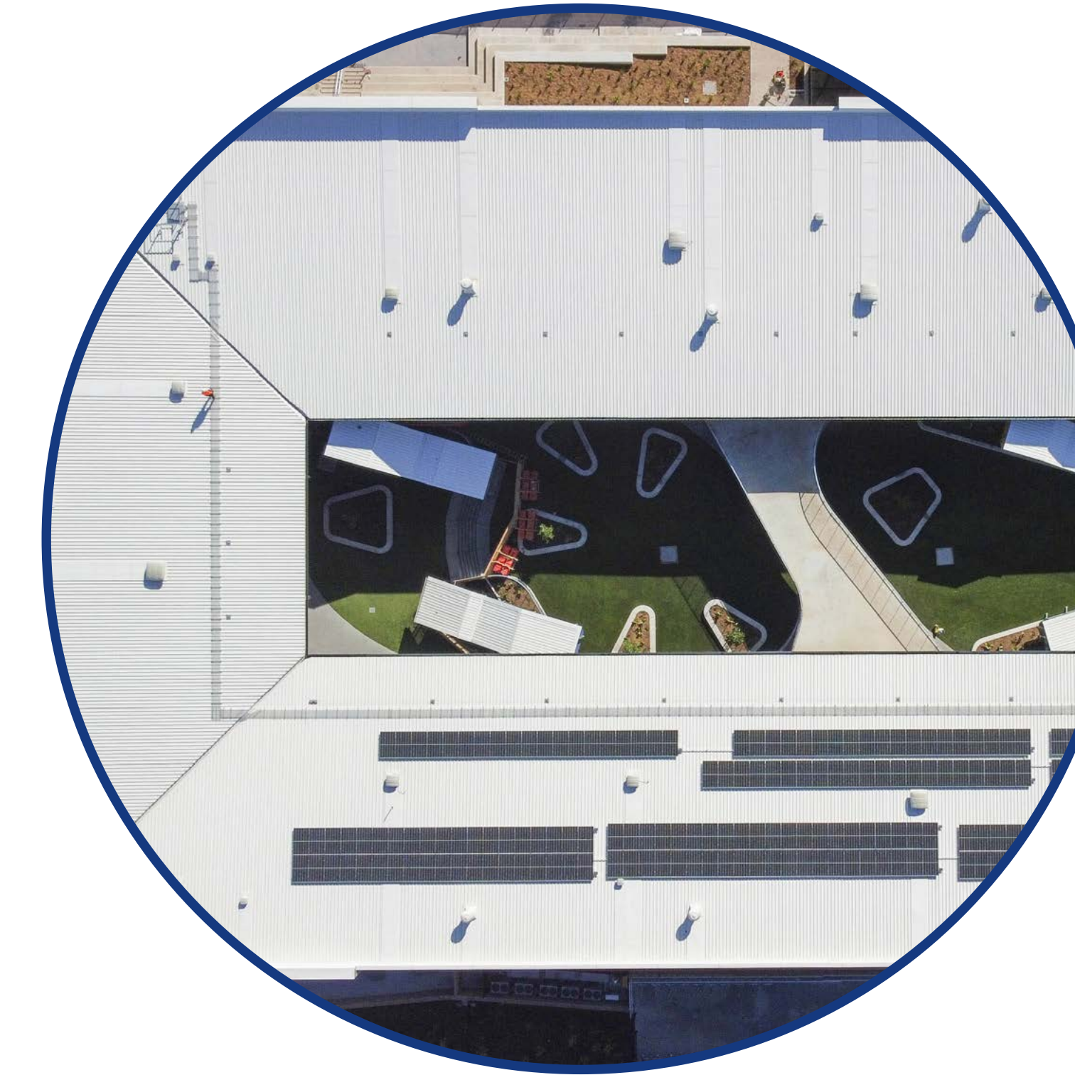
Innovative design principles including sustainability features

Further details about the school features and facilities will be shared with the community as the project progresses.