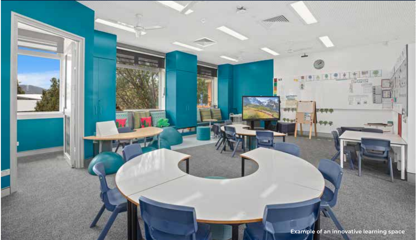
Example of an innovative learning space

The NSW Government is investing $6.7 billion over four years to deliver more than 190 new and upgraded schools to support communities across NSW. In addition, a record $1.3 billion is being spent on school maintenance over five years. This is the largest investment in public education infrastructure in the history of NSW.