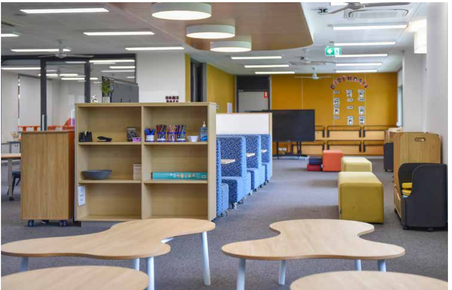
Examples of innovative learning spaces