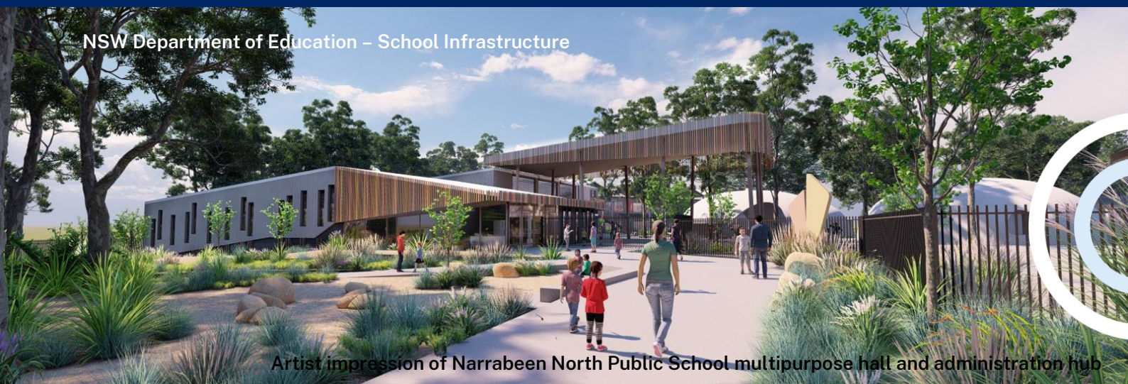
Artist impression of Narrabeen North Public School multipurpose hall and administration hub