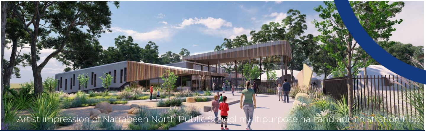
Artist impression of Narrabeen North Public School multipurpose hall and administration hub