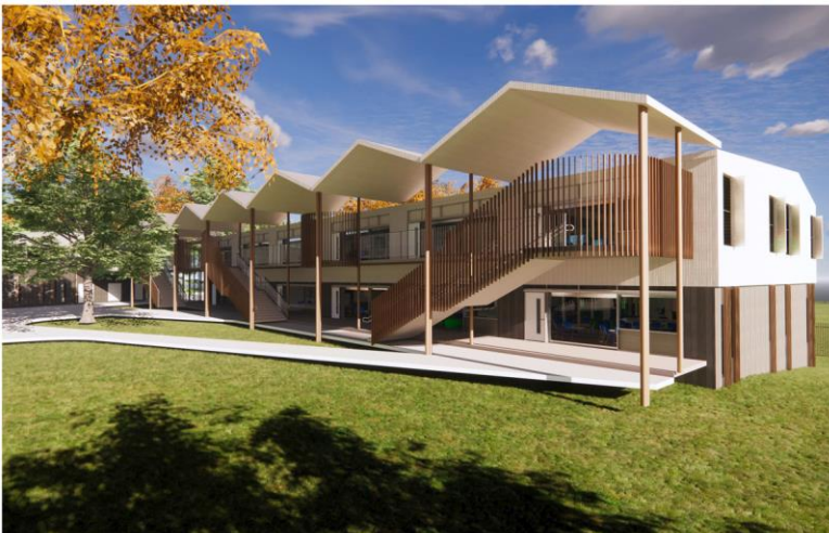
Artist impression of the new flexible learning spaces at Narrabeen North Public School.

We are committed to working together with our school communities and other stakeholders to deliver the best possible learning facilities for students. Your feedback on this project is important to us. For more information, questions, or to make a comment please contact us on the details below. Further updates will be released as the project progresses.