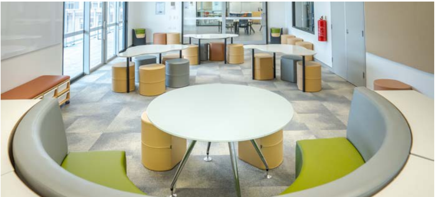
Flexible learning space