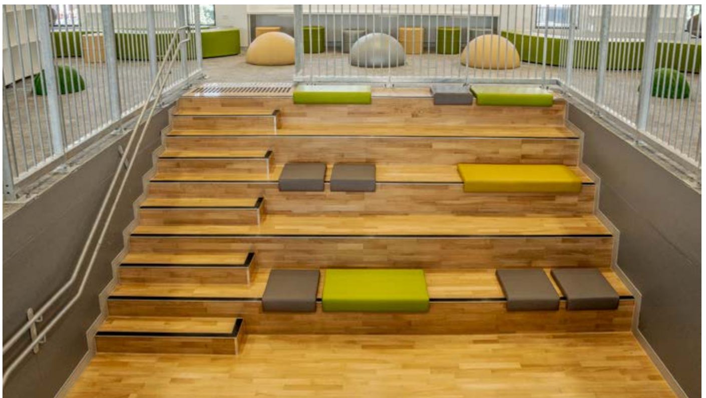
Library story time space