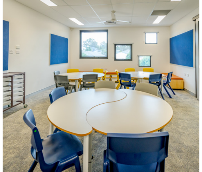
Flexible learning spaces