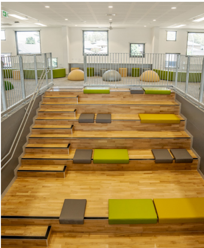
Library seating space