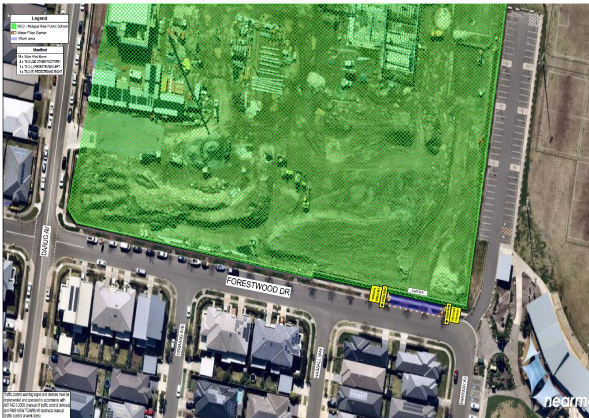
Sections of the footpath and parking bays on Forestwood Drive closed due to works, marked in blue