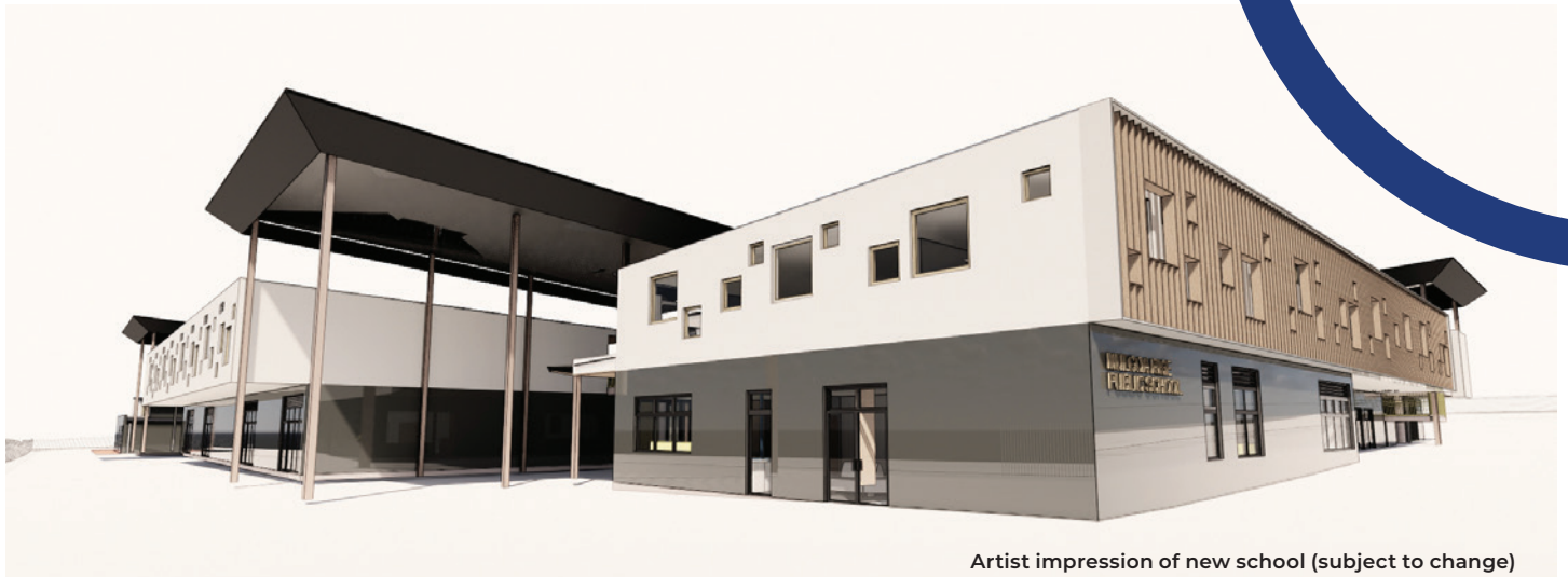
Artist impression of new school (subject to change)